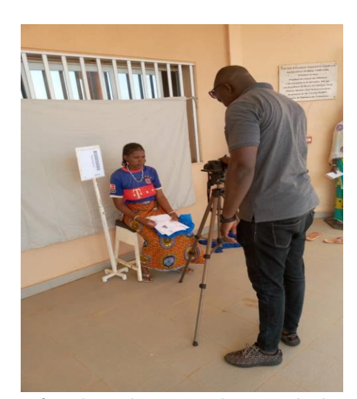
Refugee having her picture taken in Dori by the National Identification Office (ONI) after being registered.

Documentation activities for refugees also took place during the reporting period, strictly adhering to COVID-19 prevention measures. ID card renewal for refugees began on 1 July in Dori and allowed for 527 individuals to be enrolled. In Bobo Dioulasso, 526