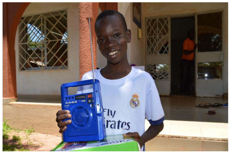
Student receiving a radio for distance learning, after completing primary education in Burkina Faso.