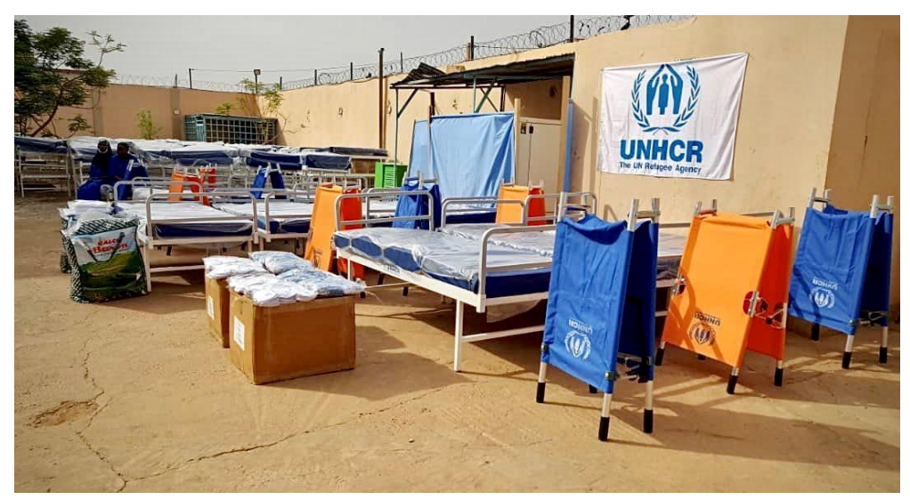
Part of the medical equipment donated by UNHCR to the Malian authorities in the Gao region to support their response to COVID-19.

Red Cross, UNHCR's partner, in Lere, Gargando, Gossi, and Douekire. In Mopti, 20 persons of concern (14 women, 6 men) took part in similar sessions conducted by AMSS, UNHCR's partner.