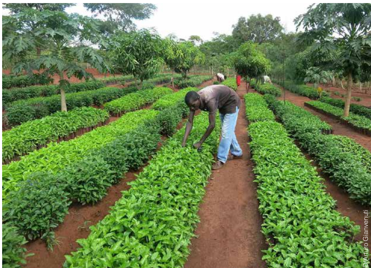
Workers hand-weed at a tree nursery in the Nyarugusu refugee camp, United Republic of Tanzania

The root systems of seedlings grown in containers will not develop freely. Seedlings should be outplanted before roots start coiling (i.e. when they start becoming entangled inside the container; Siyag, 2014), but the time it takes for this to happen varies by species, container size and other factors (e.g. growing conditions). One indication that seedlings have fully