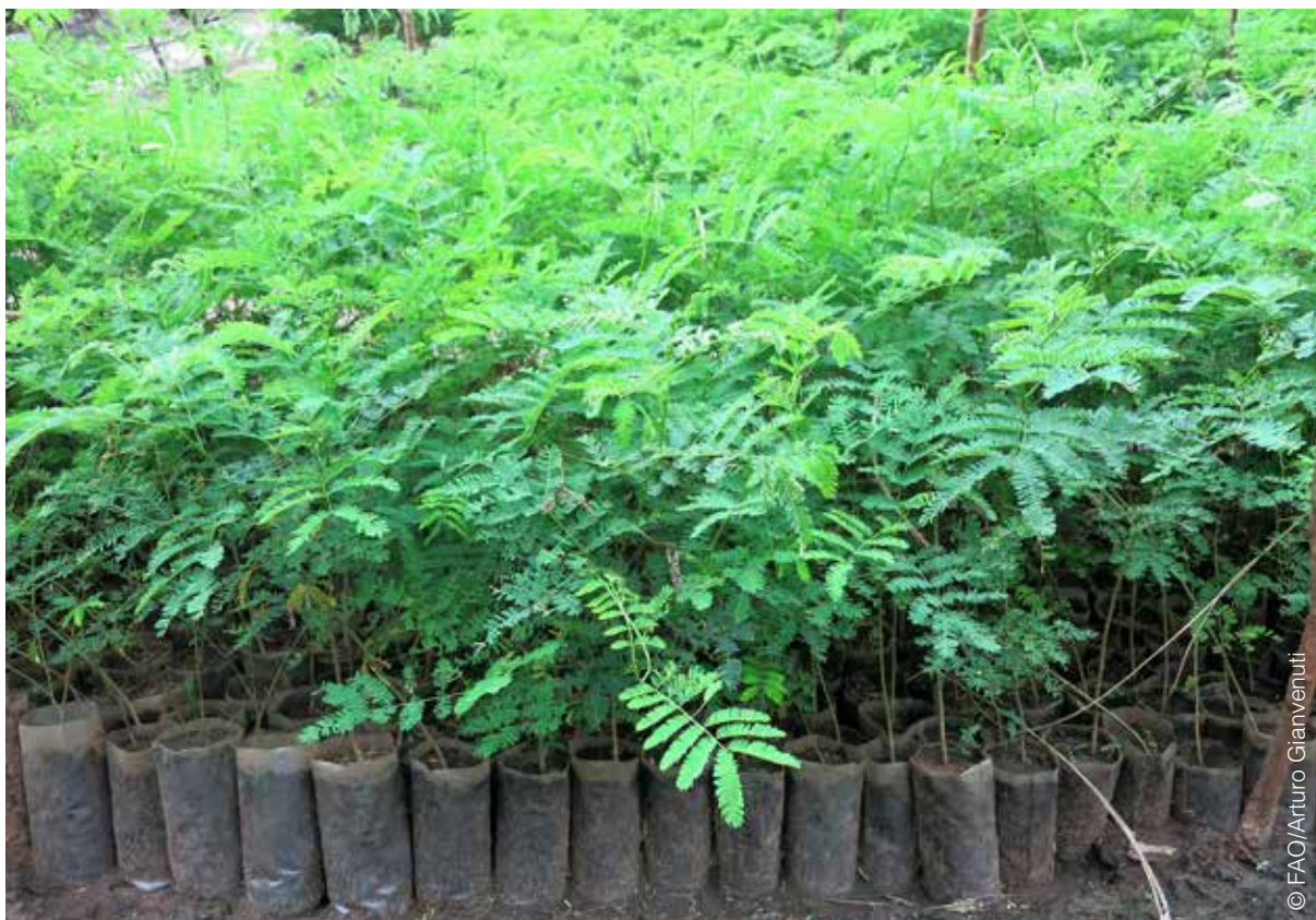
Polypots are commonly used for raising seedlings in nurseries

millimetres in diameter and a mallet can be used. Root pruning requires scissors or a sharp knife.