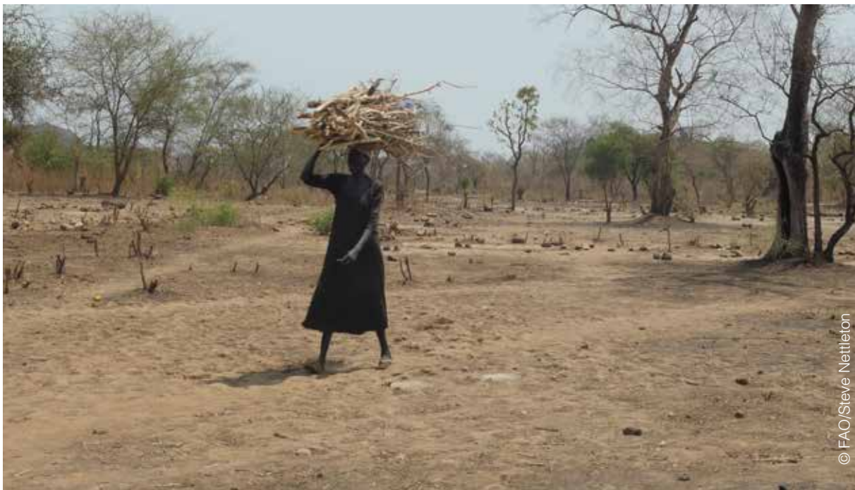
Degraded woodland near the Tierkidi refugee camp in Gambella region, Ethiopia

The prioritization of degraded forest lands for rehabilitation should take into account the location and condition of the land, the interests of stakeholders, and the availability of resources for the work. The following four strategies for the rehabilitation of degraded forest lands are described below: 1) protective measures; 2) measures to accelerate natural recovery; 3) measures to assist natural regeneration; and 4) tree-planting for rehabilitation and protection.