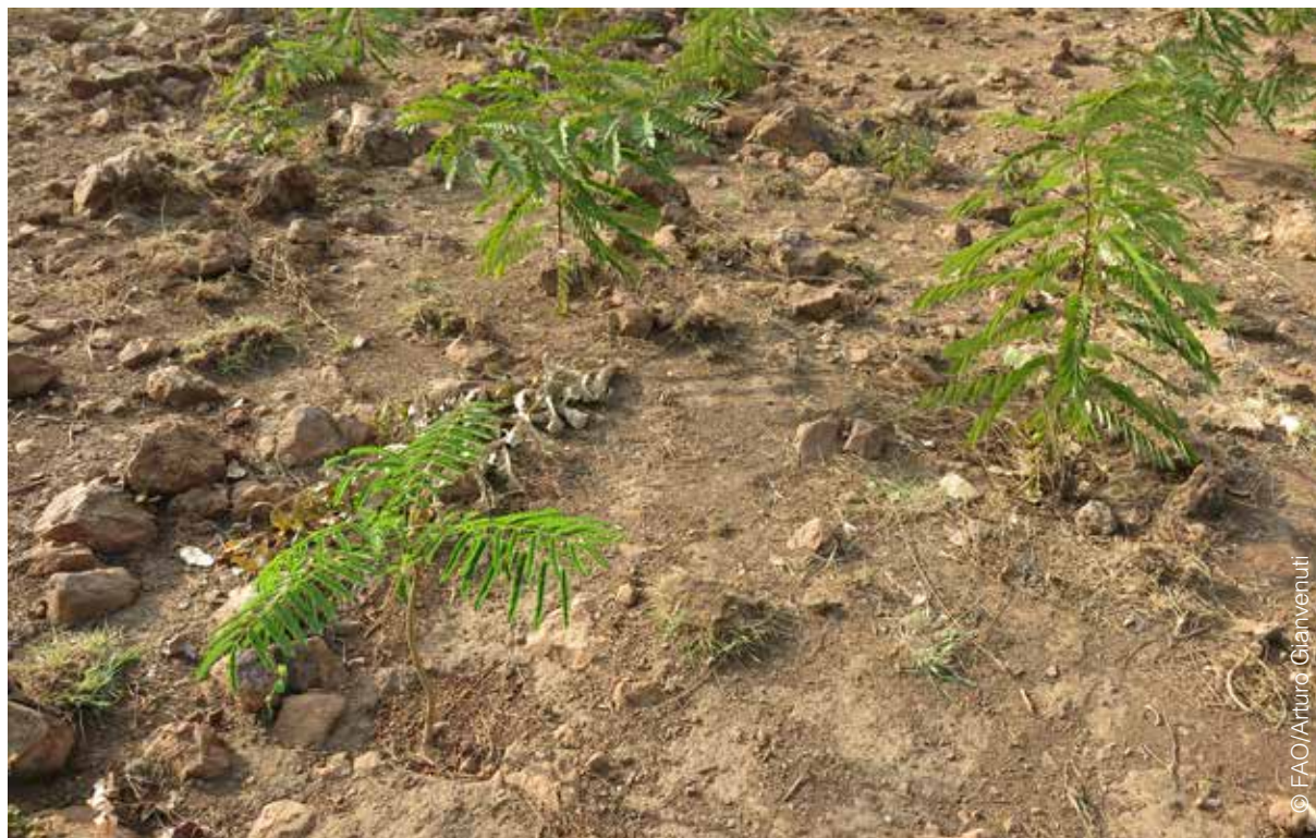
Seedlings planted at a high density for early woodfuel harvesting

In dry areas, soil preparation should occur a few weeks before the rainy season to allow water to penetrate the soil more easily when the rains start. This is only possible in light soils – it may not be possible to prepare heavy soils until they are softened by rains. In hot conditions, it is recommended that planting take place in the evening or on cloudy days to reduce evaporation (HDRA, 2002).