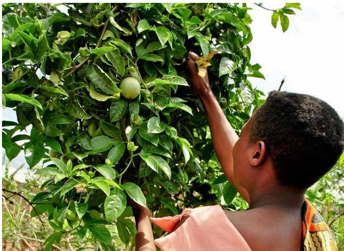
Forests and trees contribute to food security through contributions to diet and nutrition in displacement settings

Trees can be grown for their fruit or foliage (which can be used as fodder for cattle), and they can be interplanted with crops and used for different purposes. An interesting example of an agroforestry approach is the taungya system used in Côte d'Ivoire, where displaced people were given access to agricultural land and the responsibility of protecting and caring