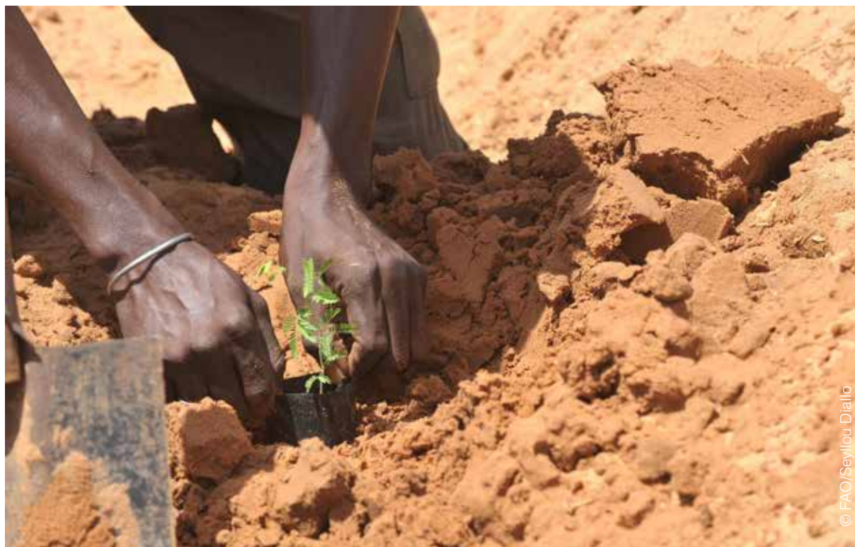
A worker plants acacia seedlings in the field

The goal of woodfuel plantations is to maximize biomass production, and this can be achieved with high-density (e.g. 8 000–10 000 stems per hectare) plantations and short rotations. Planting on bare land is likely to require site preparation; digging trenches rather than pits can be an efficient way of achieving very high-density plantings, with the ditches acting as microcatchments.