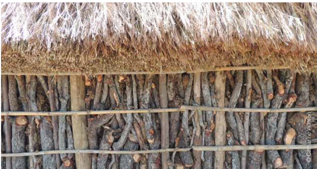
The Bidibidi refugee settlement, Uganda. Locally harvested wood is commonly used to build shelters and other household structures in displacement settings