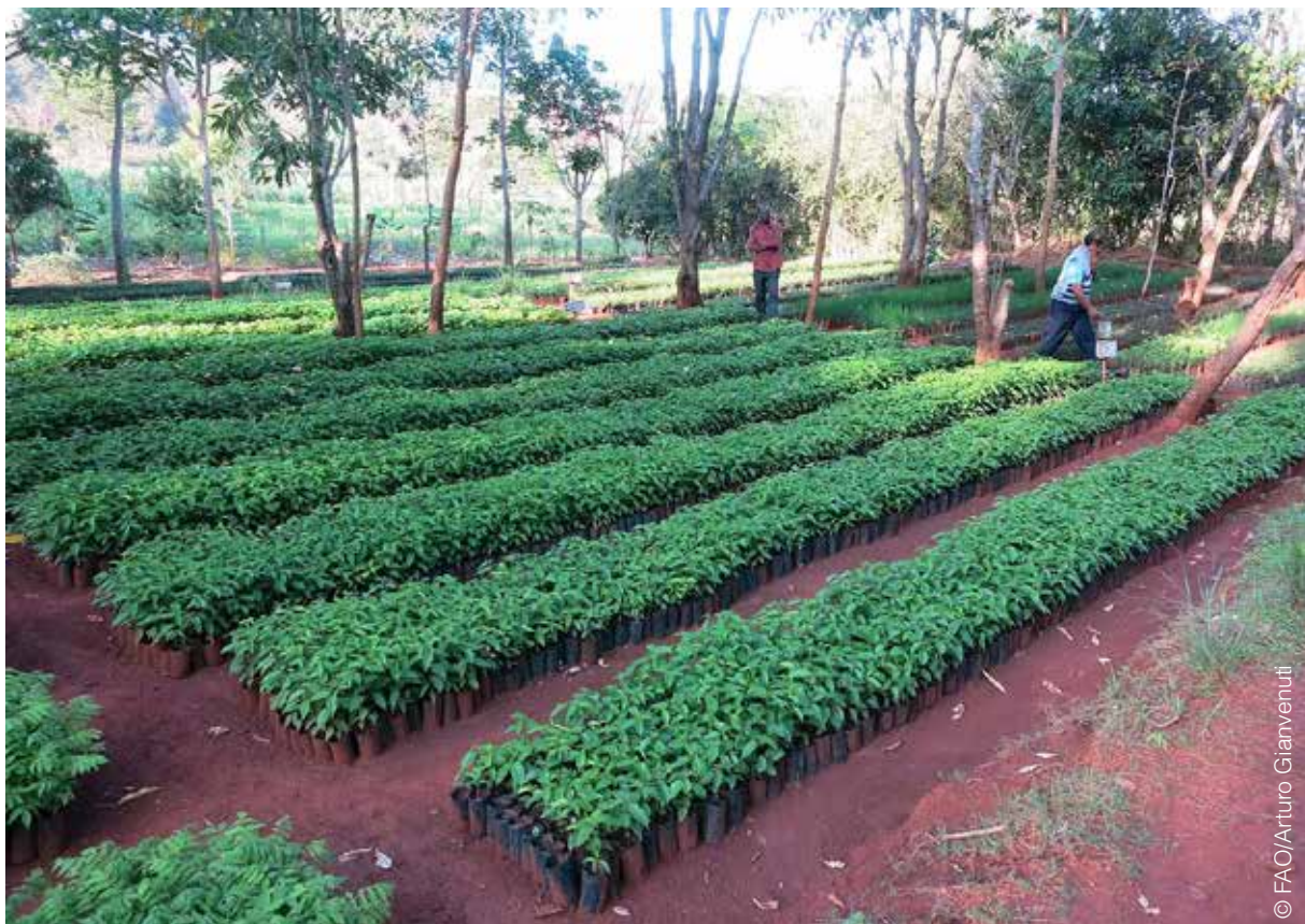
A tree nursery in the Mtendeli refugee camp, United Republic of Tanzania