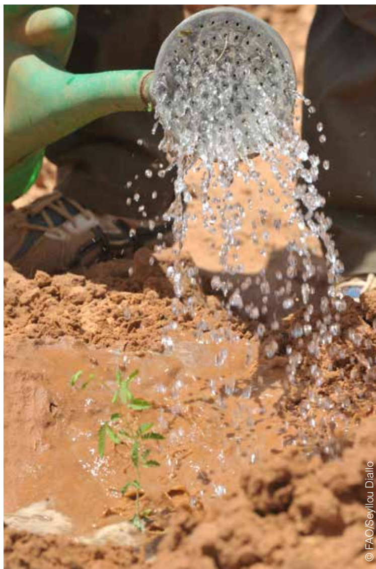
A recently planted acacia seedling is watered

Depending on conditions, two techniques can be followed. In one, the pit is refilled with soil so that the seedling collar is 10 cm below the general level of the ground (but still not covered by soil); this is termed “deep planting”, and it provides seedlings with extra water reserves in dry areas. The other basic technique is to plant seedlings on mounds so that