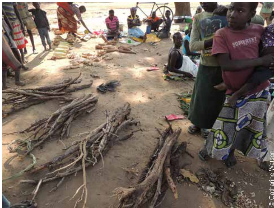
The Bidibidi refugee settlement, Uganda. Refugees have collected fuelwood to sell at the market

infrastructure, the available workforce and its management skills, and, crucially, land ownership and land-use rights will all influence technical decisions.