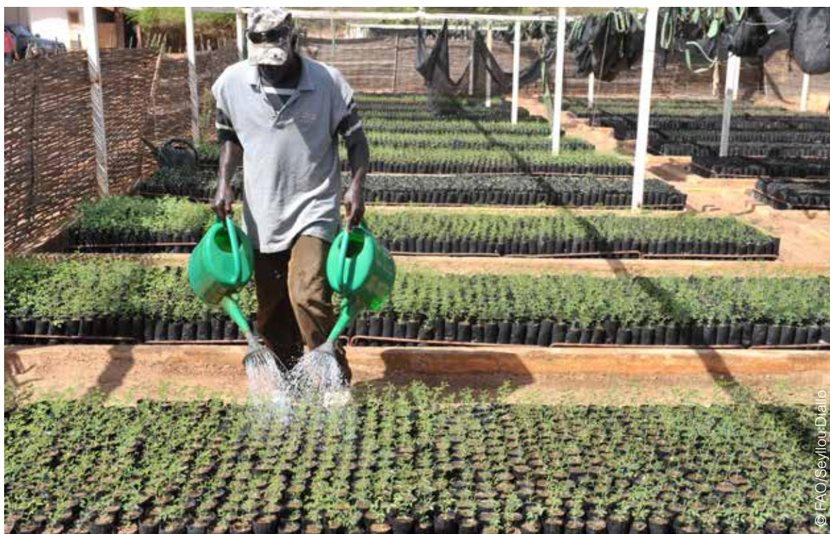
A worker waters acacia seedlings in a tree nursery

Watering should be carried out at least once per day, and twice per day on very hot (> 40 °C) or windy days (Siyag, 2014). The best watering times are early morning and evening – thereby avoiding the hottest parts of the day, when evaporation can mean that a large part of the applied water volume is lost and therefore unavailable to the seedlings.