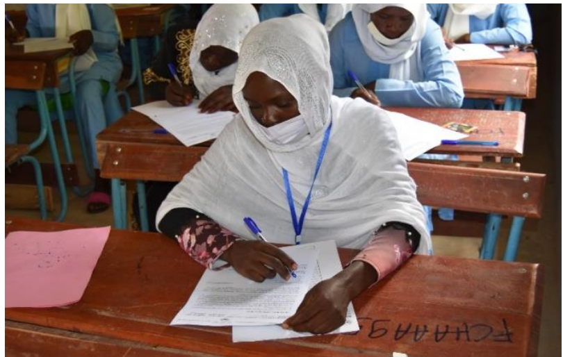
Refugee Baccalaureate candidate at Farchana in Chad.