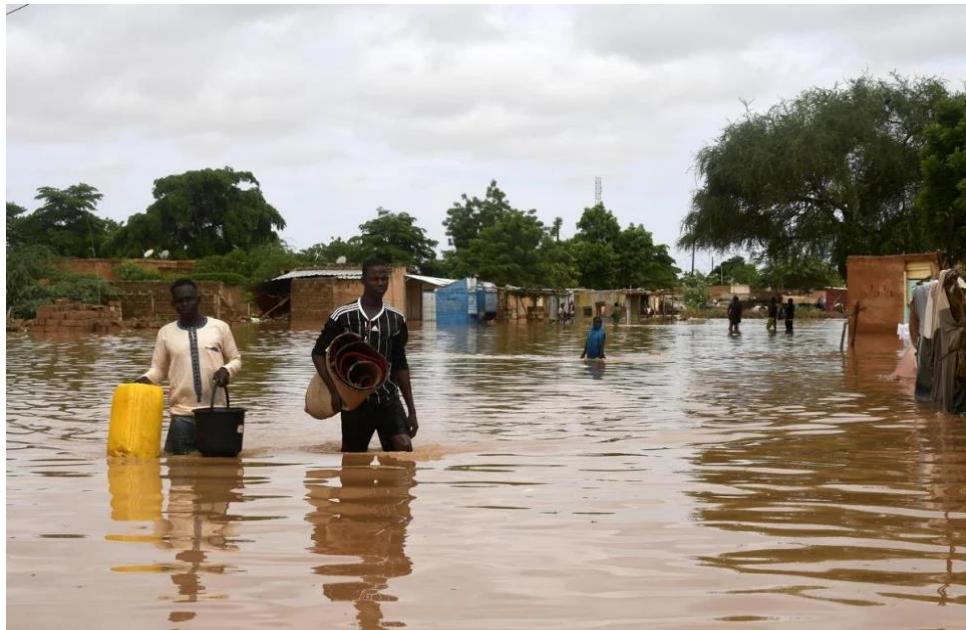
People carry their belongings in a street flooded by the Niger River in the Kirkissoye neighbourhood in Niamey, Niger, on August 27, 2020.