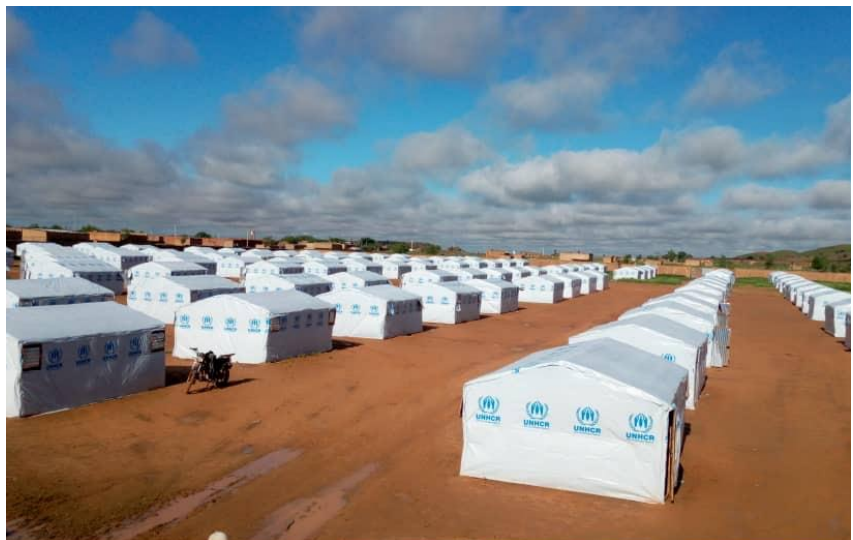
Construction of 202 shelters at the municipal stadium in Djibo in the Sahel region.