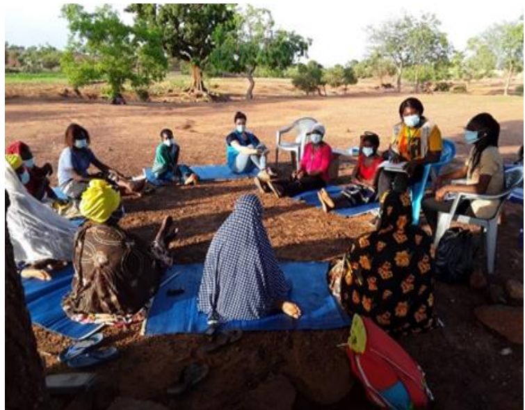
Focus group discussion held with women from the host community in Kaya and facilitated by UNHCR, ICAHD and ATAD.