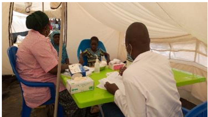
The newly established mobile clinic in the Sahel provides much needed primary health care to IDPs, refugees and host community and a strengthened response to cases of SGBV in the Sahel.