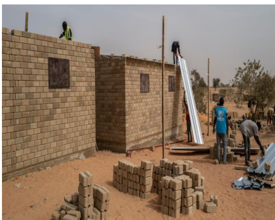
Construction of social housing for the most vulnerable refugee and host households is ongoing in the Tillabery region. UNHCR has pledged to construct 4000 social houses in Tillabery