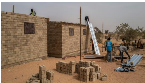
Construction of social housing for the most vulnerable refugees and host households is ongoing in the Tillabery region. UNHCR has pledged to construct 4000 social houses in Tillabery