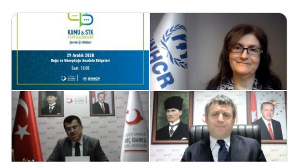
Screenshots from the final Regional NGO Meeting held with participants DGMM, UNHCR and civil society participants from Eastern and South East Anatolia

Regional meetings with NGOs on social cohesion were organised by UNHCR in December as part of the UNHCR-DGMM Joint Harmonization Initiative. Five meetings covering six geographical regions of Turkey, including the Aegean, Marmara, Central Anatolia, Mediterranean and South East Turkey and Eastern Anatolia were held thus reaching a total of 260 representatives from 167 NGOs. The first of these meetings had taken place for the Black Sea region on 30 November. The purpose of the meetings was to encourage cooperation between the public sector and civil society, to identify gaps and good practices, raise awareness on harmonization policies and practices, and to facilitate the inclusion of civil society in policy-making