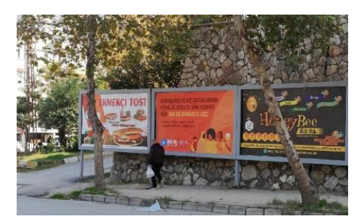
Billboards of the 16 Days of Activism Campaign were placed in different areas across South East Turkey