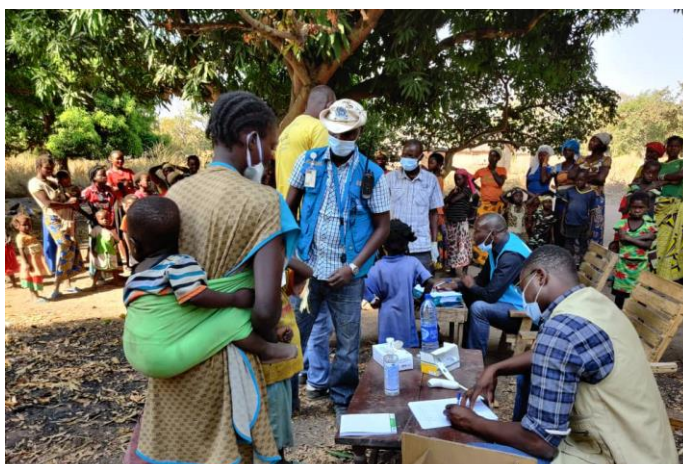
Level 1 registration for new arrivals in Kombat village