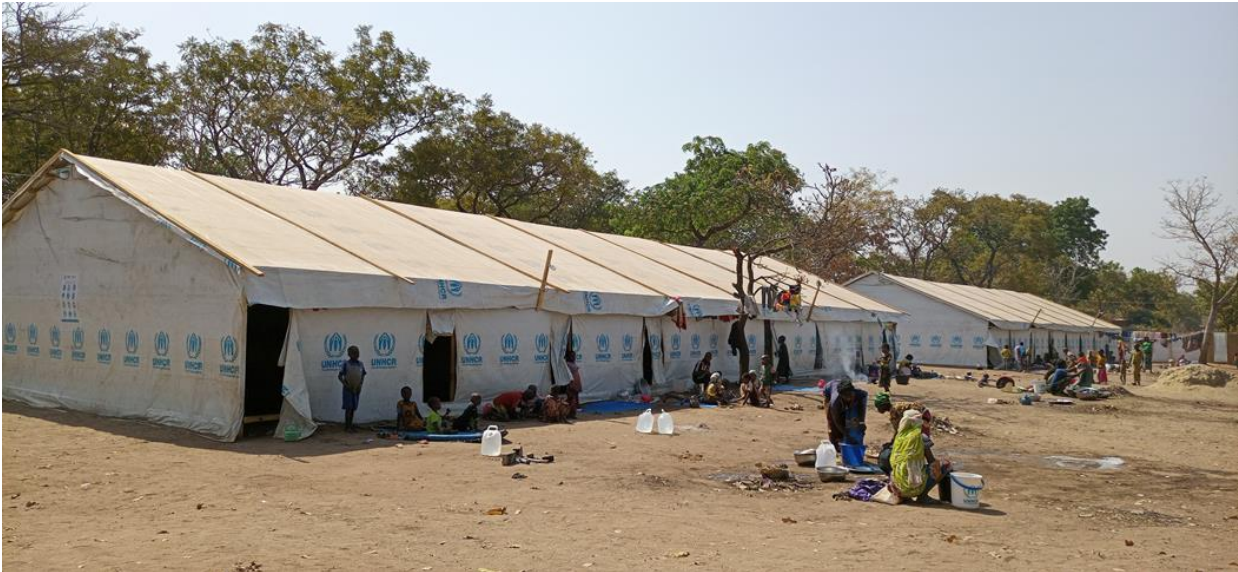
New arrivals in Gore quarantine center

The MSF-Holland emergency team arrived in Gore for an assessment and plans to work in the health and wash sectors.