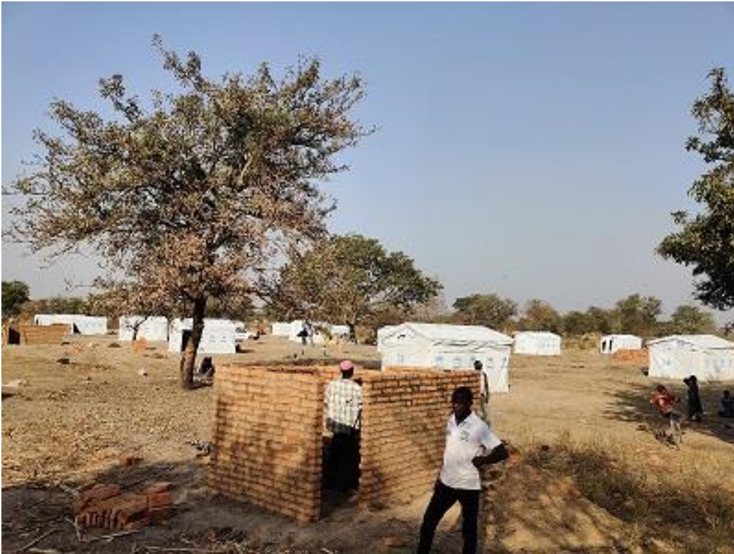
Emergency shelters under construction in Doholo camp