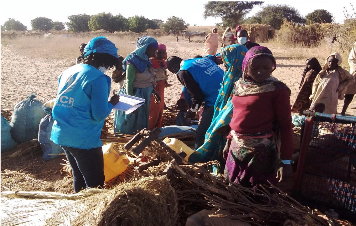
Pre-registration of new arrivals in Goungour village

Border and protection monitoring are now regularly carried out to assess the cross-border movements and identify the urgent protection needs of new arrivals.