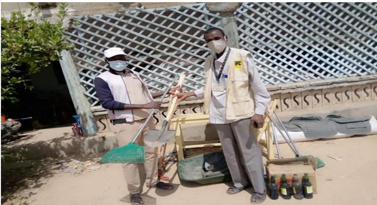
Distribution of hygiene tools to the new arrivals in the transit center (Adre)

IRC distributed hygiene kits and tools (shovels, rakes, wheelbarrows and mops) to the new arrivals to enable the cleaning of the quarantine transit center in Adre.