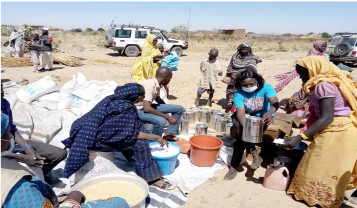
Food distribution to the new arrivals in the transit center (Adre)

WFP provided food for 15 days to 78 households/ 290 individuals in the Adre transit centres (Adre) with HIAS support in distribution.