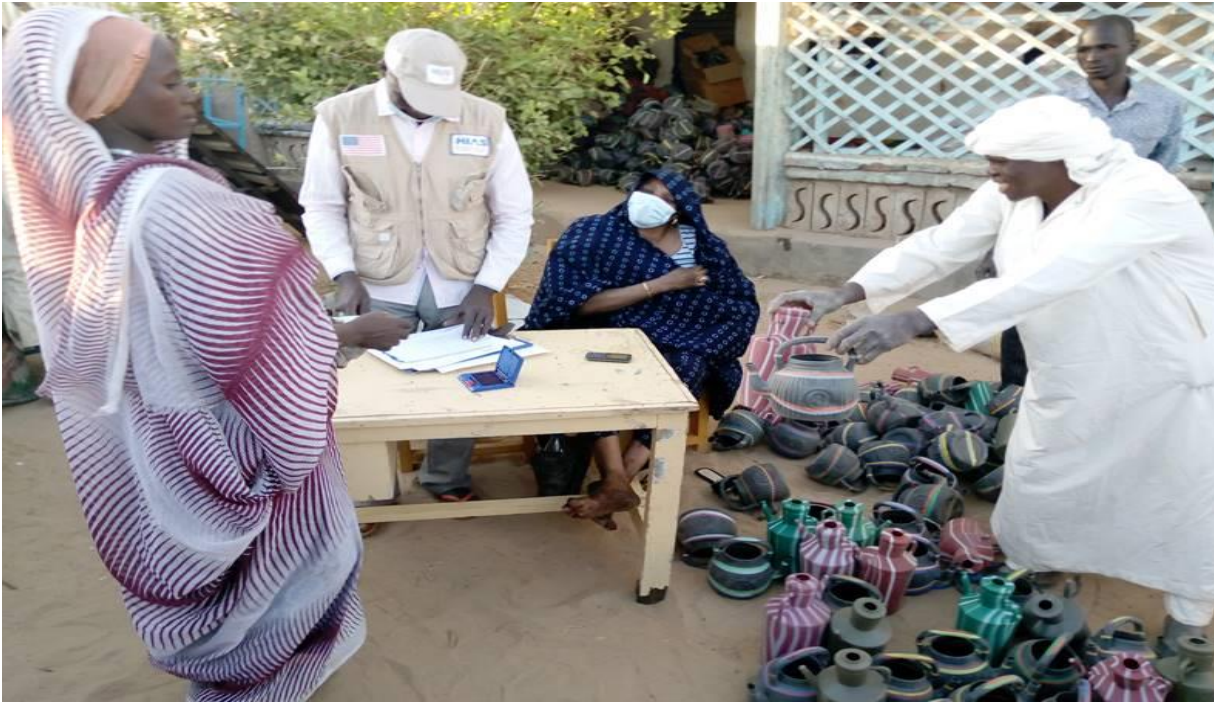
Distribution of plastic kettles to the new arrivals in the transit center (Adre)