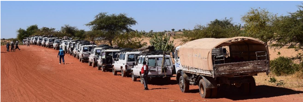
Relocation of new arrivals from Adre to Kouchaguine-Moura camp

From 2 to 11 February 2021, 209 households/810 individuals were then relocated from Adre transit center to Kouchaguine-Moura camp for a total of 254 households/ 975 individuals since January 27 th .