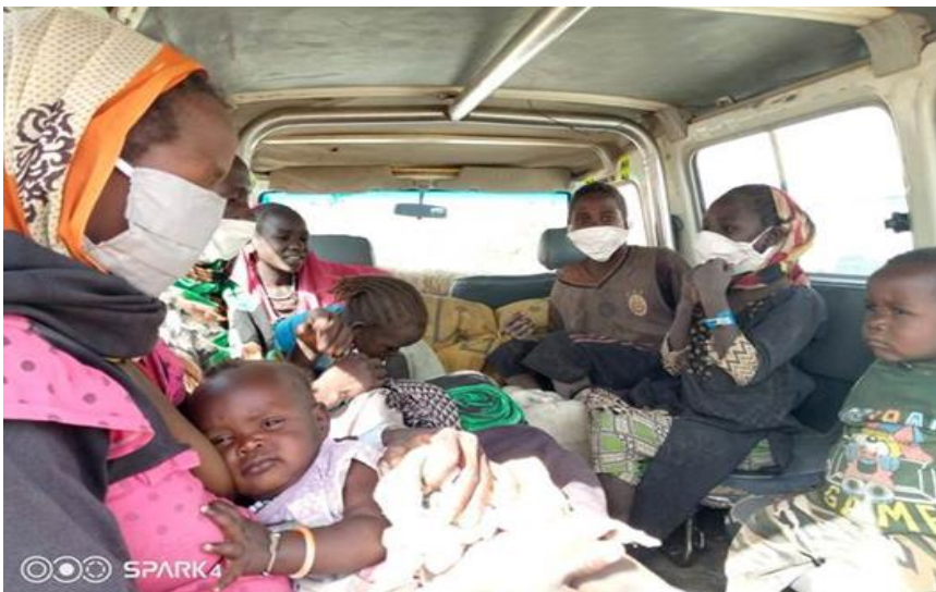
Transfer of new arrivals from the host villages to the transit center in Adre