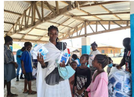
A happy nursing mother who just received face masks for her family at Ampain Camp.