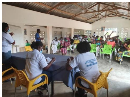
Open day interactions with new arrivals in Egyekrom Camp.