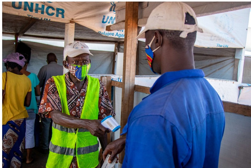
A community mobilizer checks the temperature of refugees at a distribution point in Lóvuva refugee settlement, Angola, where extra measures have been implemented to prevent the spread of COVID-19.

1,234 health facility staff and 1,829 community health workers trained on COVID-19