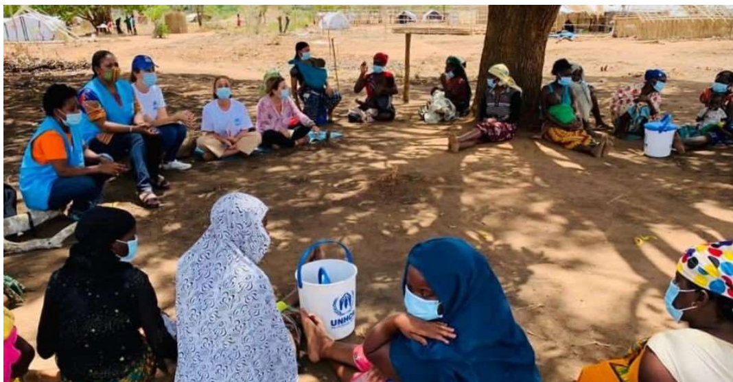
UNHCR staff consult a group of women IDPs in Nanjua, Cabo Delgado Province, Mozambique. Participants in the group discussion are provided with masks to prevent the spread of COVID-19.

social distancing, handwashing and mask wearing throughout the festive season. Following the government's introduction of tighter restrictions in light of the COVID-19 resurgence, UNHCR conducted outreach through community networks to ensure that refugee and host communities were fully aware of the new restrictions, to help ensure their compliance. Since the beginning of the COVID-19 response in South Africa, UNHCR has reached 450,000 refugees, asylum-seekers and host community with COVID-19 risk communication. Additionally, in Zambia , UNHCR, working with government, partners, refugee community health workers, and volunteers continued to conduct awareness-raising and compliance monitoring in churches, schools, work and public places in the three refugee settlements. UNHCR and partners reinforced prevention messages to encourage adherence to government's principles of social distancing, handwashing and avoiding overcrowding. Door-to-door awareness-raising was also conducted, reaching approximately 720 households in four communities including host communities. UNHCR and partners have reached more than 182,000 people in Zambia through COVID-19 awareness-raising initiatives since March 2020.