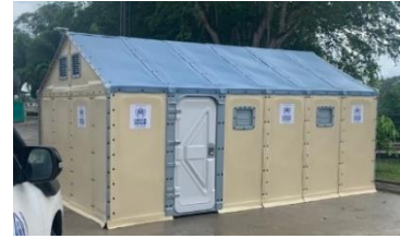
Refugee Housing Unit

2 RHUs installed at the Cultural Integration Center (CIC)