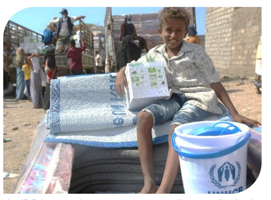
An IDP boy receives emergency supplies at a distribution site, where NFI and shelter kits were distributed to displaced Yemeni families in Taizz and Lahj governorates.

beginning of the year. A Rapid Protection Assessment conducted by UNHCR partner INTERSOS revealed that those newly displaced are in urgent need of shelter, food, water, and protection assistance. Many displaced families are forced to share shelters - with an average of three to five families under one roof limiting privacy and increasing exposure to communicable diseases and protection risks. particularly for and girls. For further women information, see UNHCR's Update on the humanitarian situation in Taizz