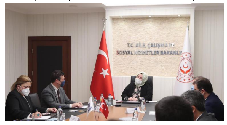
Minister Zehra Zümrüt Selçuk and Mr. Philippe Leclerc discuss means of ongoing cooperation during a courtesy visit at the Ministry.

with the Ministry. UNHCR collaborates closely with the ministry for implementation of the national policy of inclusion of refugees in social protection mechanisms. The cooperation with and support to the ministry focuses on strengthening the capacity of social service centres, child institutions and violence prevention and monitoring centres which provide protective, preventive supportive services, as well as counselling and rehabilitation. They are supported by UNHCR through staff, vehicles and materials.