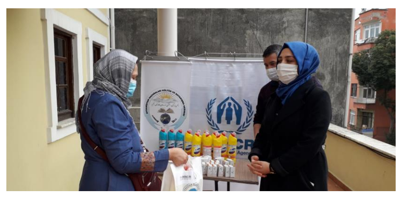
Distribution of hygiene items donated by Unilever takes place in Trabzon.

Hygiene materials generously donated by the multinational supplier company, Unilever UK, were distributed to persons in need of protection and to host community members across Turkey enabling the most vulnerable to stay safe by enhancing their hygiene at home. The donation includes 300,000 disinfectants and 150,000 bars of soap and was distributed through UNHCR's partners. Read more about Unilever's hygiene support to refugees and the host community in Turkey here.