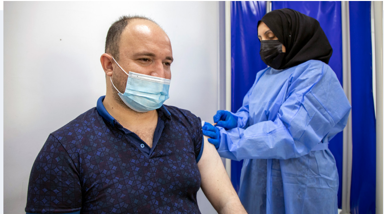
A Syrian refugee and health worker receives his first COVID-19 vaccination on 2 May 2021.

UNHCR and UNICEF are also supporting the DoH with the establishment of a COVID-19 vaccination unit in Domiz 1 refugee camp. The vaccination unit will be part of the country’s national vaccination plan and will facilitate the vaccination of refugees in both Domiz 1 and Domiz 2 refugee camps (Duhok Governorate).