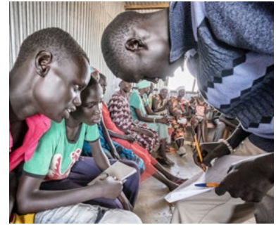
Refugee youth participating in a livelihoods training in Kakuma refugee camp.

UNHCR, for example, describes innovative financing as financial arrangements to support its work that are not traditional donor funded grants. Rather, this is financing that helps deliver more sustainable, efficient, and effective resources and that brings in a wider range of stakeholders and their financial and other capabilities. 4 Instruments include investments, impact bonds, swaps, funds, guarantees, and blended finance. UNHCR focus areas include: using blends of grant and other financing to scale up impactful programming; financing higher-quality and more cost-efficient infrastructure; reducing operational costs; and investing in the productive capacities of refugees. 5