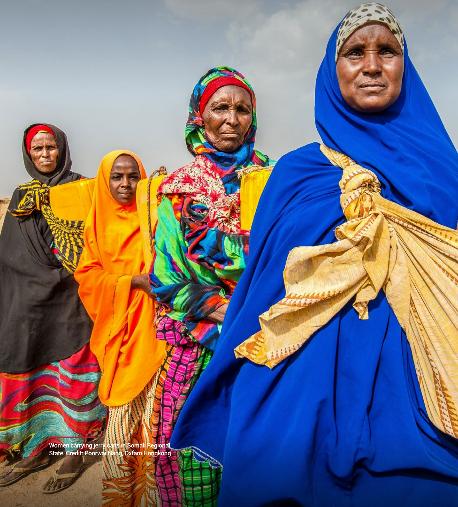
Women carrying jerry cans in Somali Regional State.