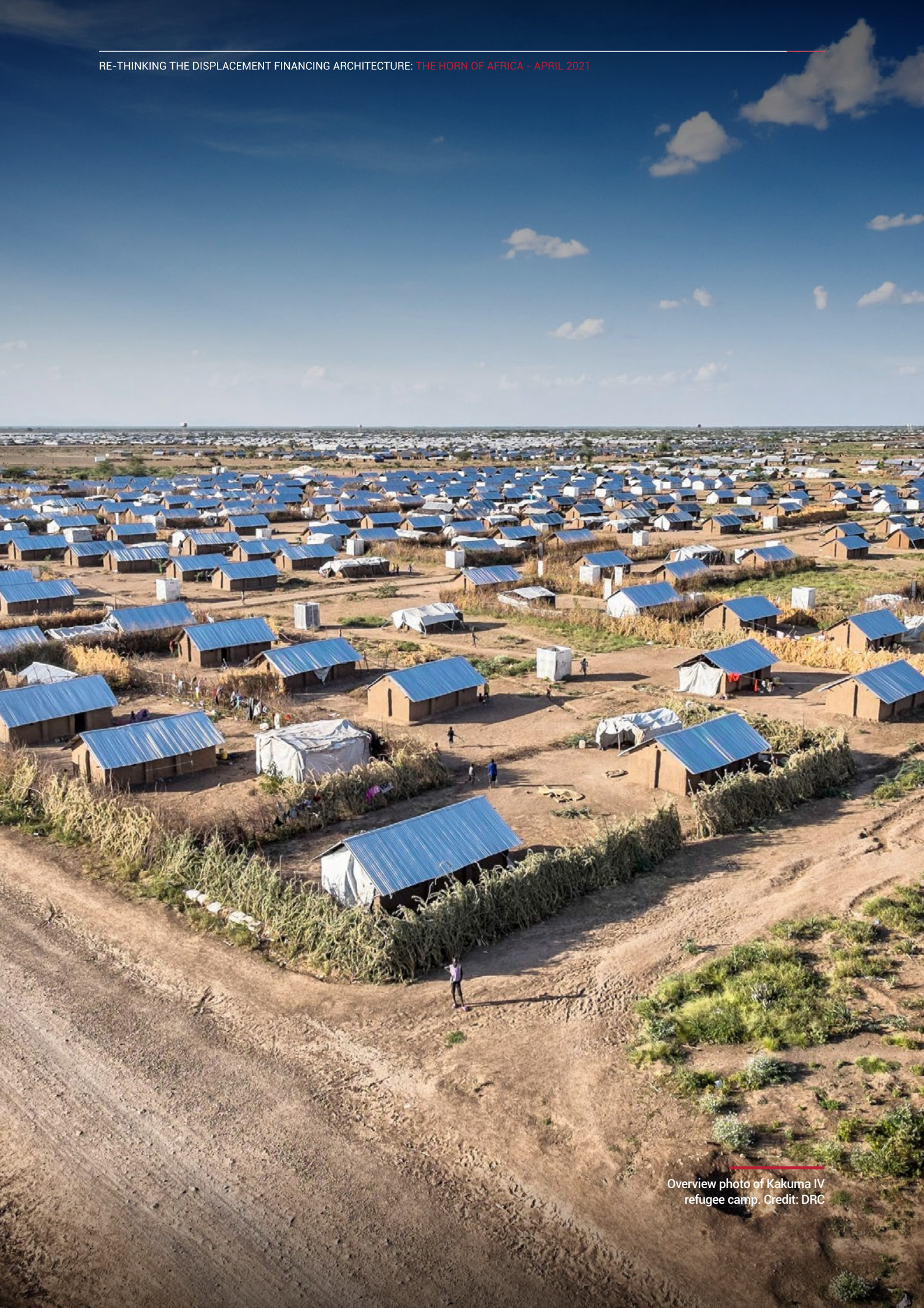
Overview photo of Kakuma IV refugee camp.