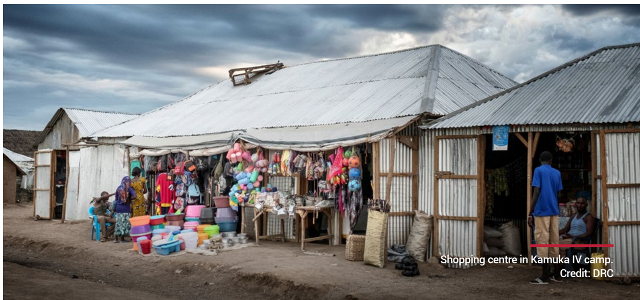
Shopping centre in Kamuka IV camp.