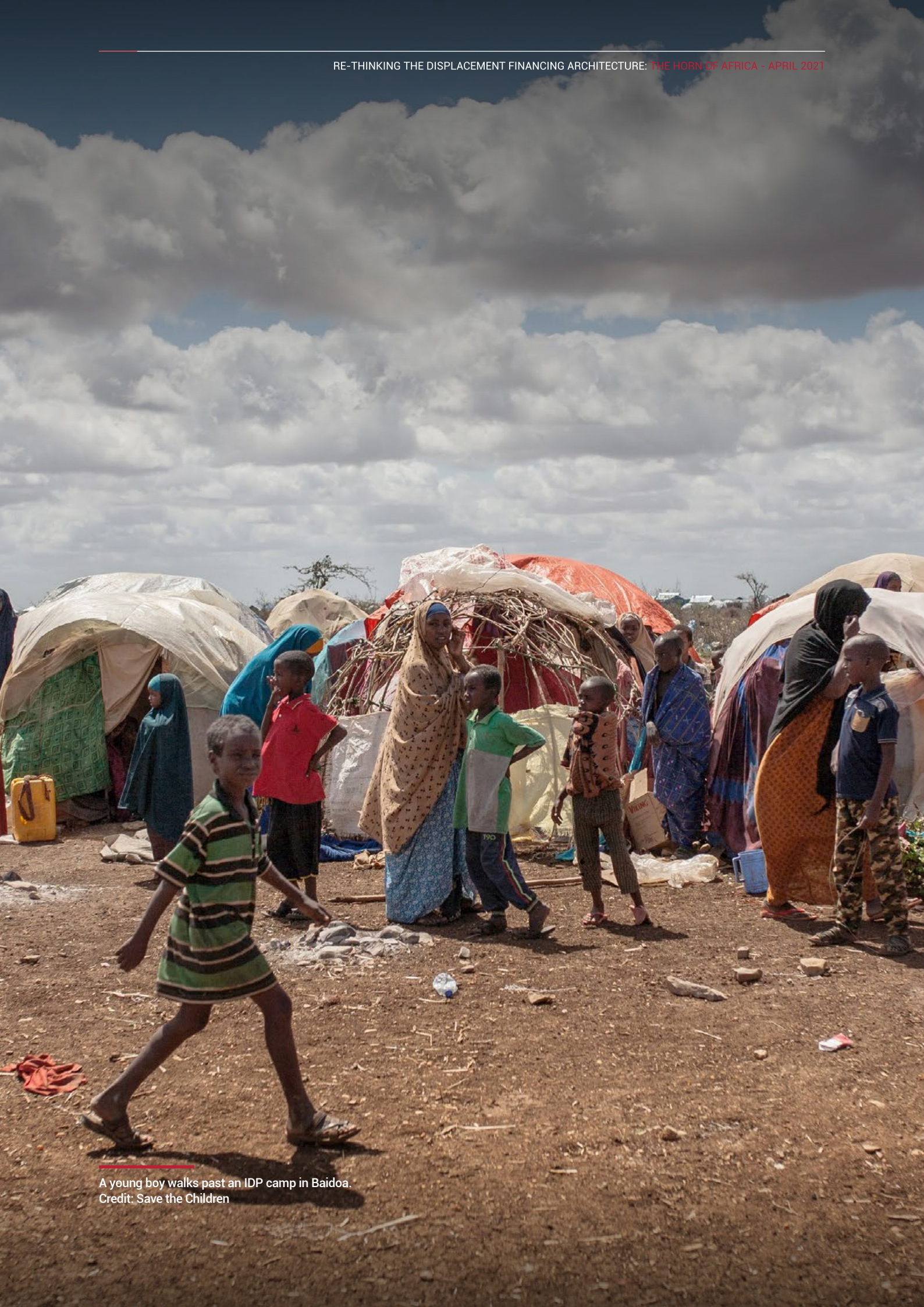
A young boy walks past an IDP camp in Baidoa.