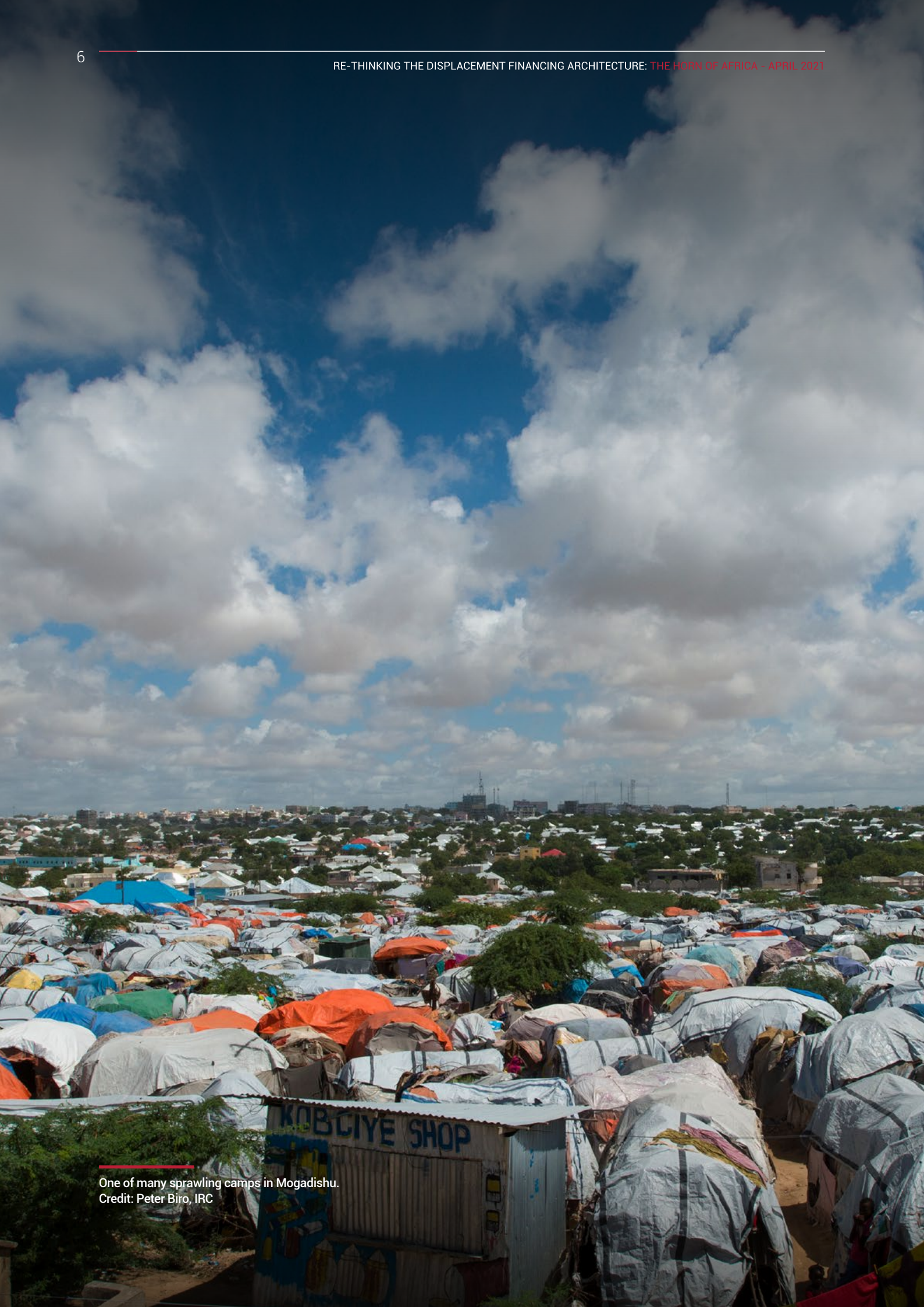
One of many sprawling camps in Mogadishu.