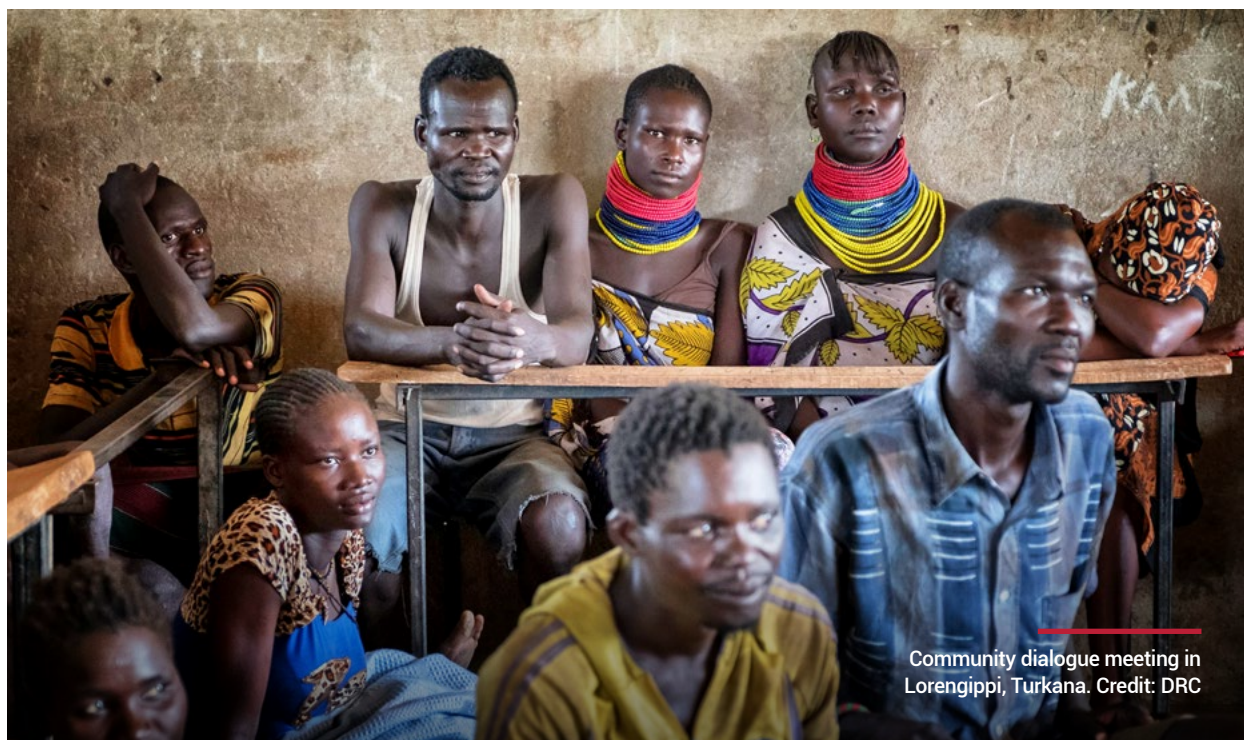
Community dialogue meeting in Lorengippi, Turkana.