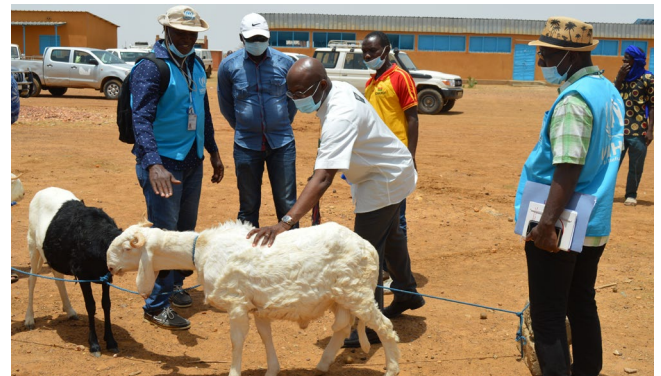
«Visit of exhibitions and achievements by the UNHCR Representative at WRD2021 »