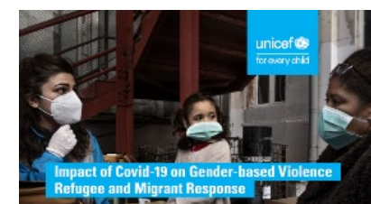
A brief review of how UNICEF's Action against Gender-based Violence affecting Refugee and Migrant women and children in Bulgaria, Greece, Italy and Serbia programme has responded to COVID-19

Introduction This brief looks at the impact of COVID-19 on UNICEF's ongoing gender-based violence (GBV) programme in Bulgaria, Greece, Italy and Serbia. The programme has supported the impact of the pandemic on GBV survivors and service providers, including the impact of the pandemic on the identification of unaccompanied and separated girls (UAGs) in Bulgaria, Greece, Italy and Serbia. Regional Refugee and Migrant Response to GBV Regional Refugee and Migrant Response to GBV (RRMG) is a joint initiative of UNICEF, UNHCR, and the European Union. It aims to provide a coordinated response to the needs of refugees and migrants, with a focus on gender-based violence. The RRMG programme is implemented in Bulgaria, Greece, Italy and Serbia. UNICEF's GBV programme provides ongoing support to survivors and service providers in the region. The programme is implemented in Bulgaria, Greece, Italy and Serbia. The programme provides support to survivors and service providers, including the impact of the pandemic on the identification of UAGs in Bulgaria, Greece, Italy and Serbia.