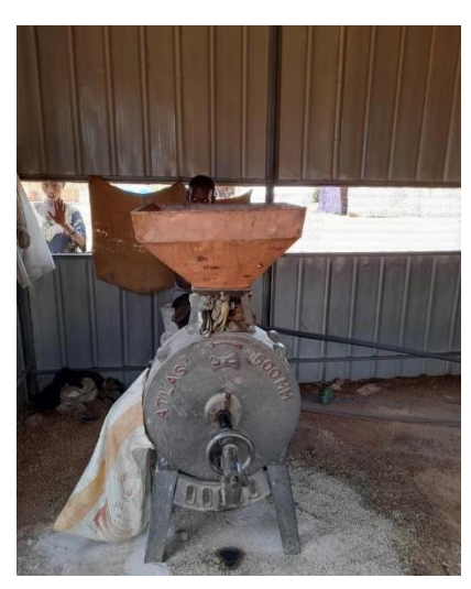
Two grinding mills are now operational in Um Rakuba camp