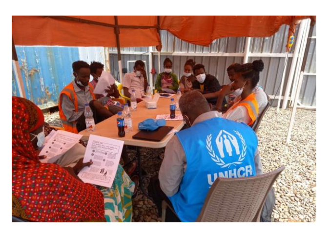
PSEA training in Um Rakuba camp

During the reporting period, UNHCR led a comprehensive workshop on protection from sexual exploitation and abuse (PSEA) in Um Rakuba camp targeting 36 community volunteers, 25 community leaders, 23 camp officials, 19 police staff and 3 security personnel. Through this training, participants learnt about UNHCR's code of conduct, exploitation and abuse sexual prohibited and strongly discouraged behaviour, the consequences of breaching these standards, and how to ensure victims of SEA have access to support. A similar training is currently ongoing in Tunaydbah settlement.