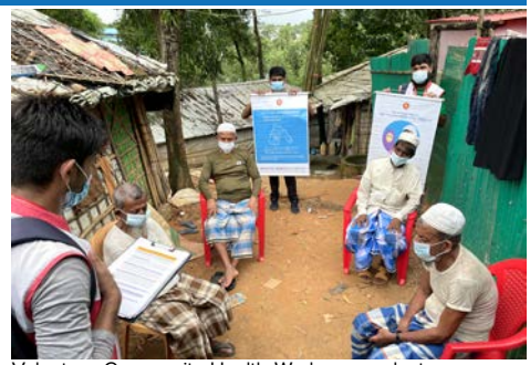
Volunteer Community Health Workers conduct awareness sessions on COVID-19.