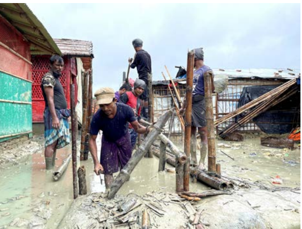
Refugee volunteers repair a bridge following the heavy monsoon rains in July.

Bangladesh continued to see a significant increase in COVID-19 positive cases in July. As of 31 July, 2,451 COVID-19 cases, and 27 COVID-19 deaths were confirmed in the camps. Worryingly, more than 1,800 of these cases were recorded since May 2021, representing over 70 percent of total cases reported since the pandemic began in March 2020.