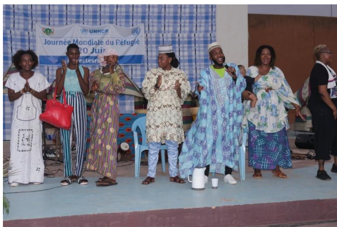
Celebration of world Refugee Day in Niamey