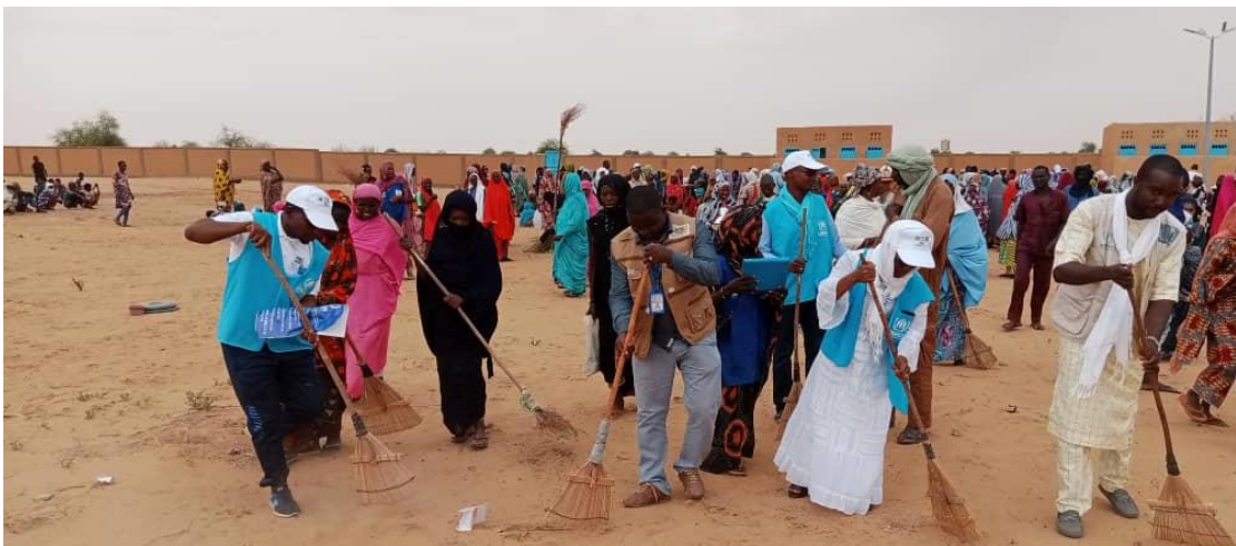
Sanitation session at the Health centre built by UNHCR with the support of the EUTF in Abala