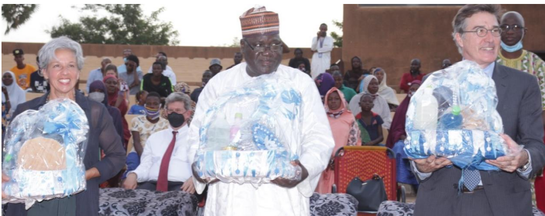
Gifts of art products and covid-19 prevention materials made by refugees to the UN Resident Coordinator, the Secretary General of the Ministry of the Interior and the UNHCR Representative in Niger.