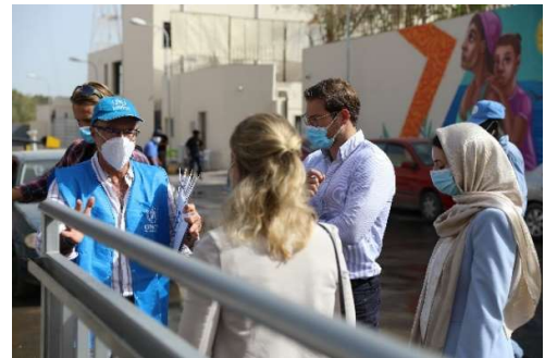
A delegation from the Netherlands visiting UNHCR's Registration Office in Tripoli.

Special thanks to our major donors: Canada | European Union | Germany | The Hellenic Republic | The Holy See | Italy | Luxembourg | The Netherlands | Norway | United Kingdom | United States of America | Other Private Donors .