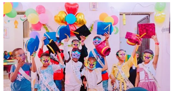
Refugee students celebrate their graduation from the Early Intervention and Learning Centre (EILC), following which they will continue their learning within the general public education system.

During the reporting period, ten refugee children completed their placements in an advanced class at the Early Intervention and Learning Centre (EILC) in Basateen run by UNHCR partner INTERSOS. The centre supports children with disabilities who are unable to access formal education. The most advanced class prepares students to integrate into the general public education system in Yemen. Since the beginning of the year, the centre has supported 82 children, 56 per cent of whom are from Yemen. The EILC team organized a graduation ceremony to celebrate the children's accomplishments. In the coming months, UNHCR will provide assistance to EILC to support the centre in purchasing learning materials.