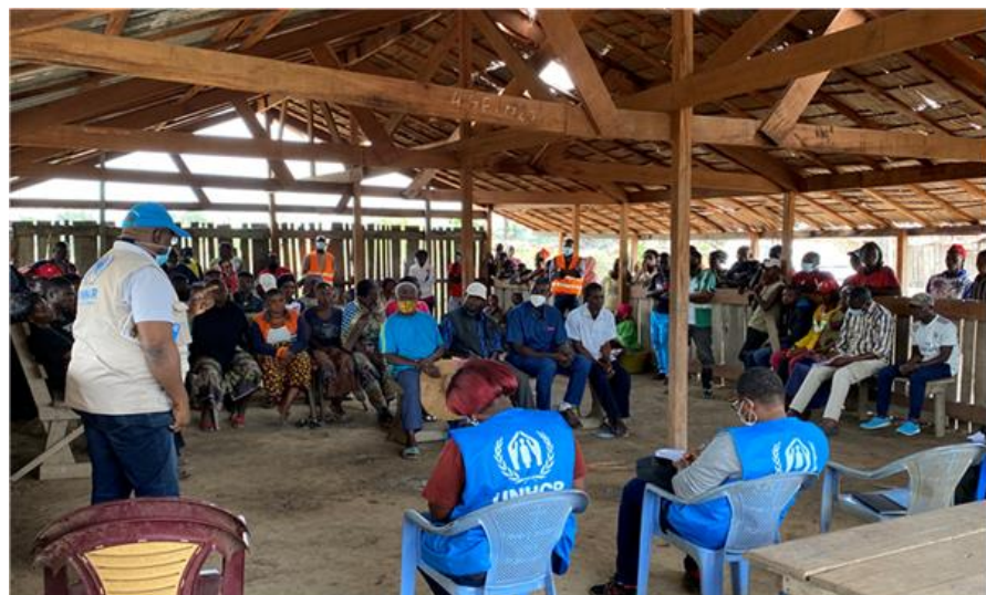
New arrivals from CAR at an orientation session with UNHCR in Bétou.