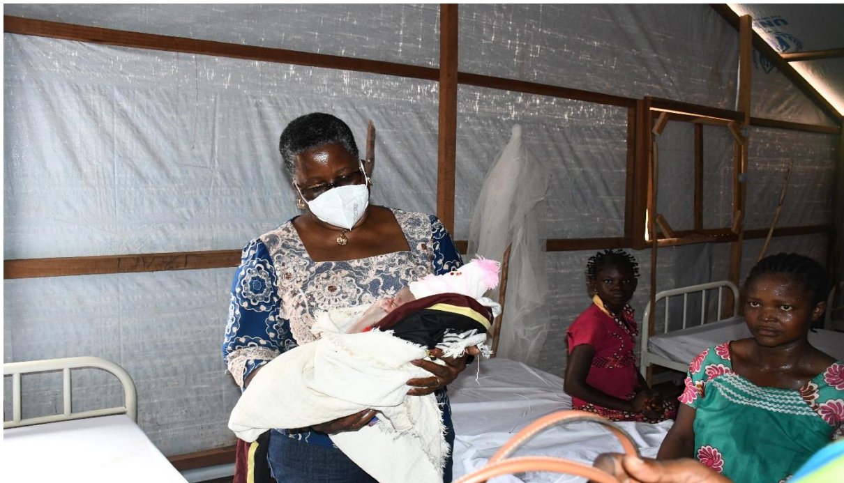
Liz Ahua, UNHCR DRC Representative greets a baby at the Modale health centre supported by UNHCR, during a visit to North Ubangi with the Permanent Secretary of CNR.

Local authorities in Bosobolo Territory, North Ubangi Province have granted around 9000 hectares of arable land for agriculture to CAR refugees in the localities of Sidi and Boduna, North Ubangi Province.