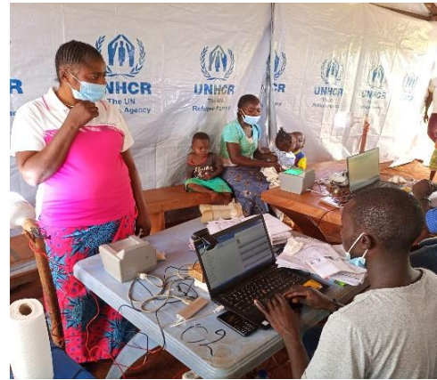
CAR refugees participate in a physical verification exercise in Boyabu camp, South Ubangi Province