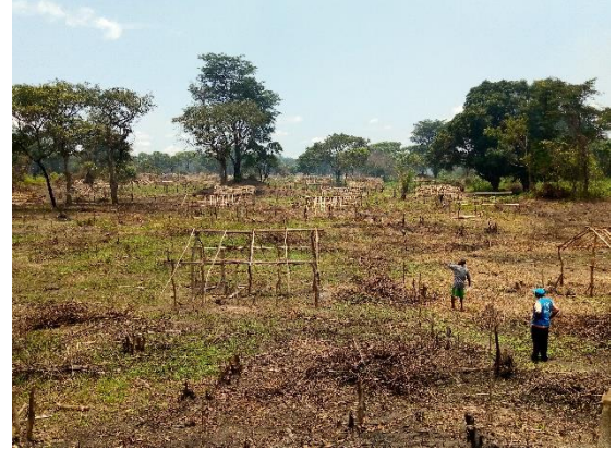
CAR refugees build shelters with the support of UNHCR on the land granted to them by local authorities in North Ubangi.

A majority of CAR refugees continue to live in precarious conditions in hard-to-reach areas close to the banks of the rivers forming the border with CAR, without basic shelter and facing acute food shortages. Nearly 13,000 households are still in need of urgent shelter assistance.