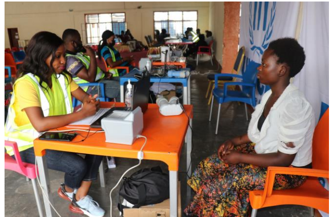
Refugees during a verification registration process in Goma, North Kivu Province.