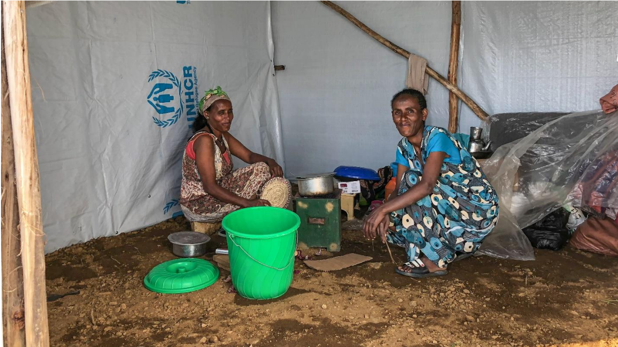
The relocation of internally displaced persons who had been hosted in schools to Sabacare 4, Mekelle, Ethiopia.