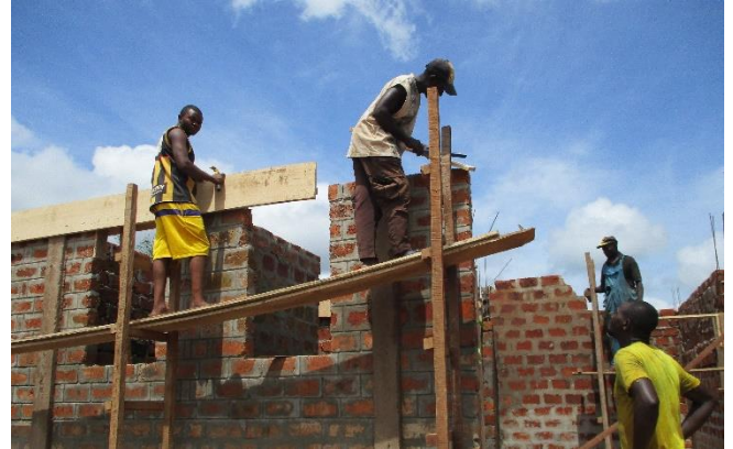
Ongoing construction of the Modale health center in North Ubangi Province