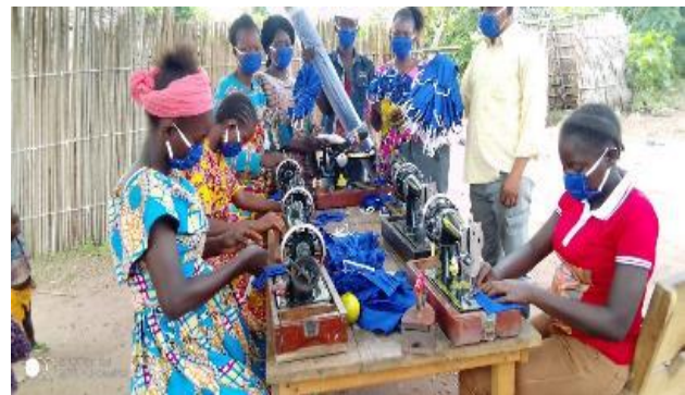
A group of women refugees produces face masks for the community of Boyabu, South Ubangi Province