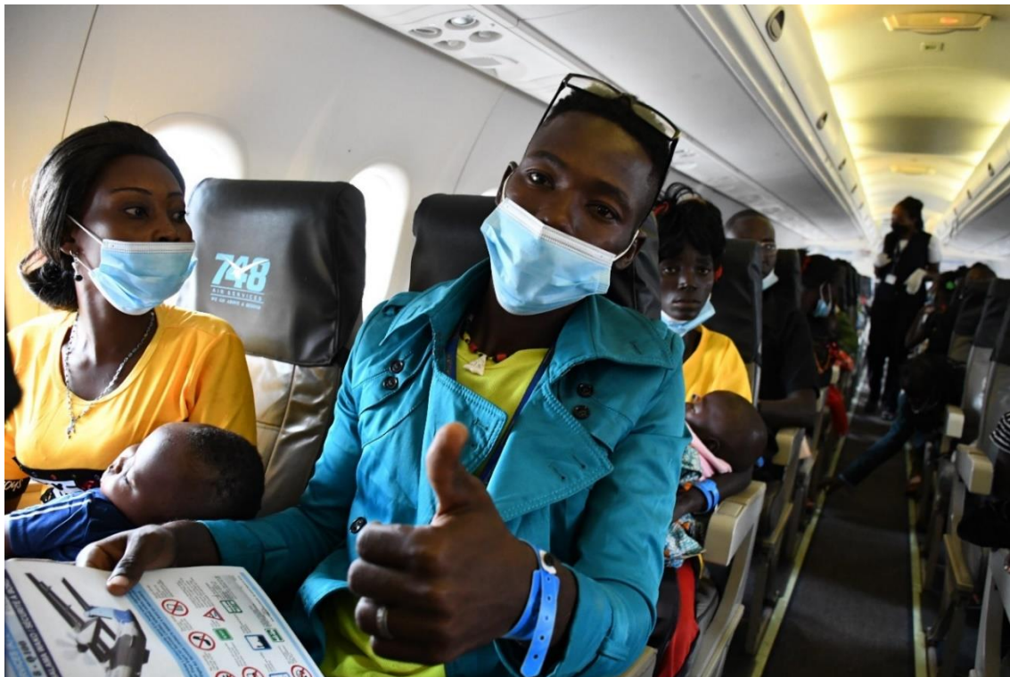
A CAR refugee family returns home via the UN humanitarian flight from Gbadolite to Bangui, after eight years living in DRC's Inke camp, North Ubangi Province

In November 16 15,756 refugees have benefitted from a WFP cash distribution in Bosobolo Territory, North Ubangi province.