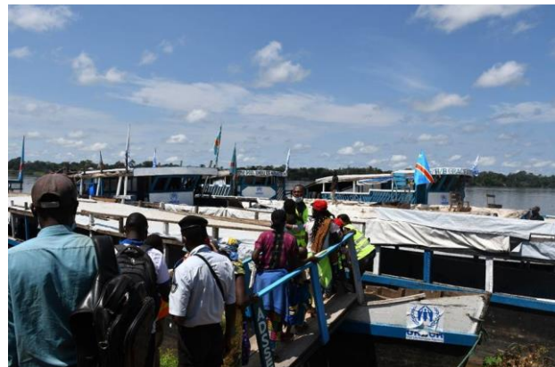
Refugees from Boyabu camp, South Ubangi Province, return home to Bangui by boat thanks to UNHCR and CNR support