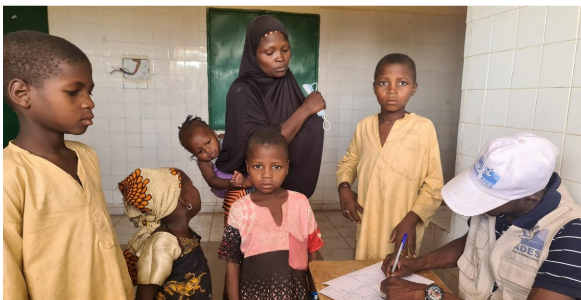
This month, UNHCR has registered 11,070 Nigerian refugees and 1,814 Nigerien returnees in 7 villages in the department of Madaoua in Tahoua region of Niger.