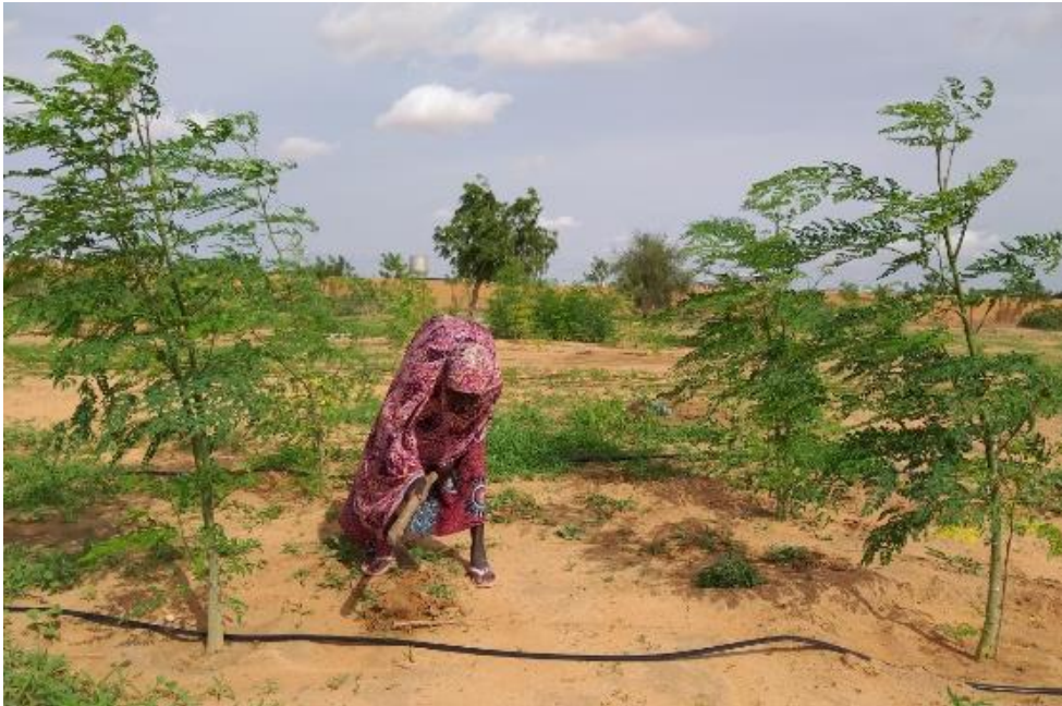
A refugee engaged in farm gardening in Hamdallaye

UNHCR evacuated 172 vulnerable asylum seekers from Libya to Niger on the evening of 5 November . This was the first evacuation flight to Niger in more than a year, following lifting of a ban on humanitarian flights by Libyan authorities. All the evacuees received food, medical care, psychosocial support and preliminary accommodation in two houses in Niamey before their transfer to the ETM transit site in Hamdallaye while their cases are being processed for durable solutions.