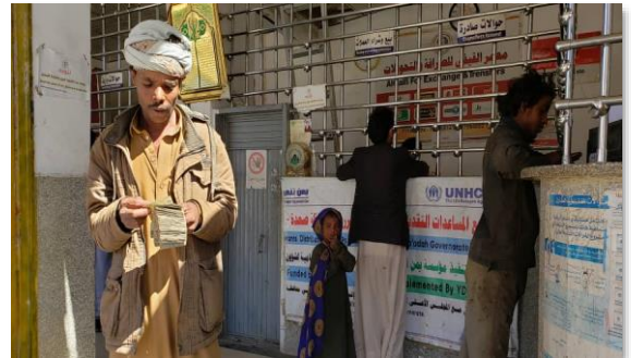
An IDP in Sa'ada city receives cash assistance provided by UNHCR through Al-Amal Bank.

Pending final year-end figures, UNHCR distributed more than $72 M in cash assistance in 2021, reaching close to 1.4 million individuals. The majority of beneficiaries were internally displaced Yemenis who are four times more likely of experiencing hunger than general population. The primary modality of assistance was through multi-purpose cash assistance, followed by rental subsidies.