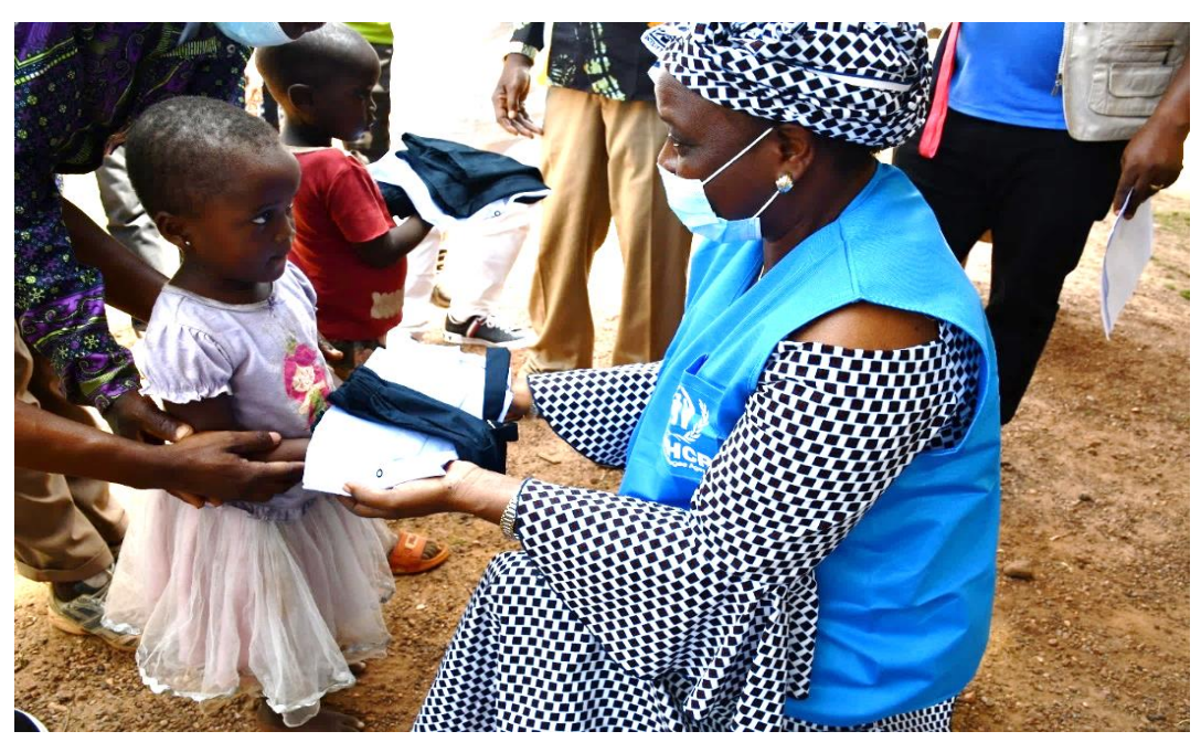
The Head of UNHCR Gbadolite sub-delegation hands over a uniform to a first-grade student at Salongo 2 school in Nzakara, North Ubangi Province

In December 2021, 5,005 refugees have benefitted from a WFP cash-for-food distribution at the Modale development hub, North Ubangi Province.