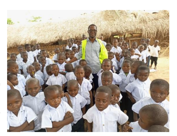
UNHCR partner ADSSE distributes school supplies and uniforms to students in 19 schools in North Ubangi province