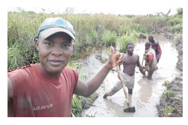
Mole refugees and members of the host community work together to develop a fishpond in Mole, South Ubangi

• Thanks to the support of UNHCR and AIDES, the agropastoral cooperative "Maboko" of the Mole camp (South Ubangi Province), composed of 17 refugees and 13 host community members has invested in a project of building 30 fishponds on the banks of a stream located near the camp which will be used to develop fish farming activities. To date, four of the 30 ponds are being developed.