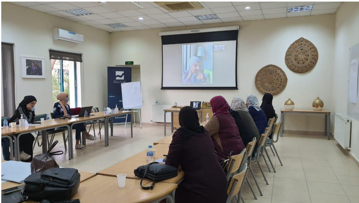
During the storytelling workshop conducted in JRF community center.