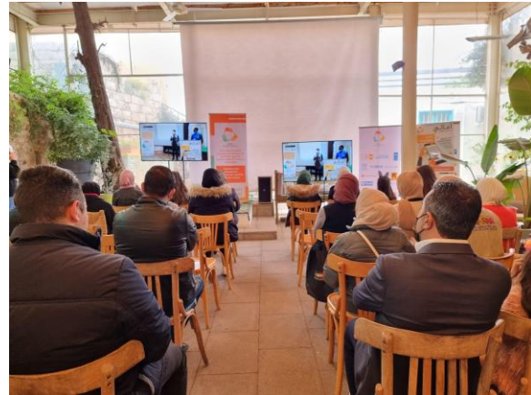
Participants attending the joint event in Amman, listening to the joint opening streamed from Zaatari Camp.