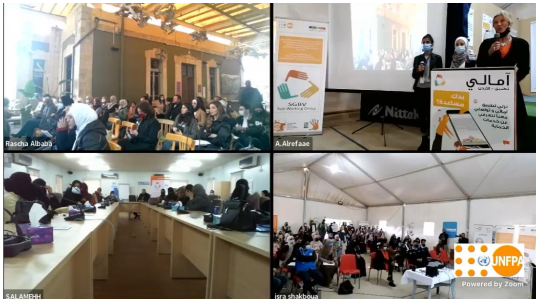
Snapshot from the live-stream on UNFPA Jordan Facebook Page

The remarks included reflecting on the key messages of this year's sub-theme and with the action of calling everyone to join efforts to combat and put an end to all forms of violence against women and girls.