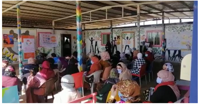
The joint simultaneous event in Azraq Camp at IRC's center in Village 3.

Moreover, the WG organized an opening event to launch the campaign on 25th of November which included opening remarks by UNHCR, UNFPA, and IRC, where remarks included also the joint key messages developed by the GBV SWG. The event included different forms of theater plays from silent theater, flash mob to interactive theaters presenting the GBV SWG key messages which were presented mostly by adolescent girls.