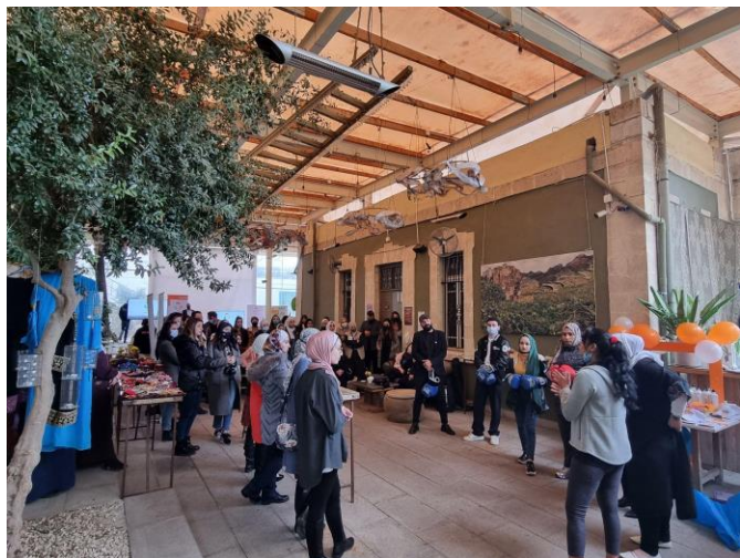
Participants gathered for the self-defense session provided by volunteers from IFH.

Also, a group of adolescent girls, participants of UNFPA's 'Me & My Mobile' course in collaboration with IFH and Zain, together with a group of adolescent girls from Plan International raised awareness on the Psychosocial Support service and the Amaali App where PSS services are available there. Moreover, three volunteers from the HeForShe movement presented a Bingo game on gender equality where they distributed prizes for the top 3 winners. The event ended with a song presented by Plan International on girl's empowerment.