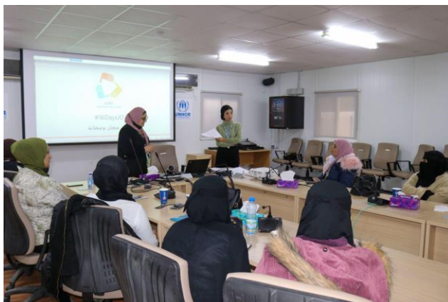
A discussion on the GBV SWG video with women and girls stories on forms of controlling behaviors.

In addition to the joint event, the WG jointly developed a video tackling some of the key messages developed by the GBV SWG. The video was published on UNHCR's twitter account, in addition to other social media platforms and also shared among the different WhatsApp groups with beneficiaries.