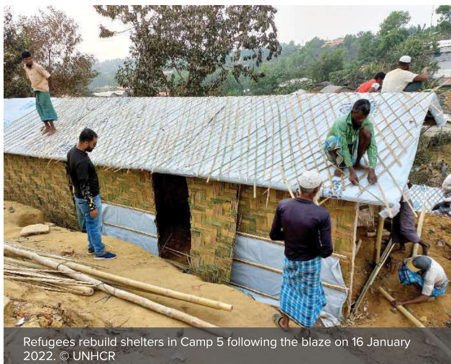
Refugees rebuild shelters in Camp 5 following the blaze on 16 January 2022.