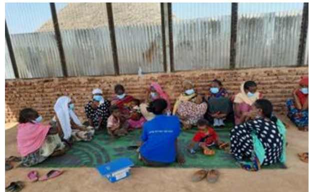
Refugee women and girls participating in PSEA awareness sessions in Um Rakuba