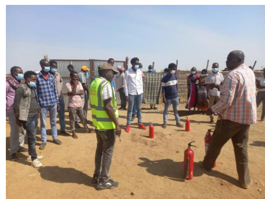
Refugee volunteers receiving fire safety training in Tunaydbah

Fire safety awareness and trainings conducted for refugees: UNHCR, DRC and Gedaref Fire Brigade held two (2) fire safety trainings in Tunaydbah for 39 members of the refugee fire safety committee. In Um Rakuba, following the fire safety trainings in December 2021, DRC has launched a dynamic sensitization efforts in Tigrinya to raise awareness on fire hazard, practice different fire scenario and immediate measures to extinguish the fire.