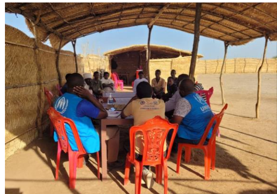
Meeting with refugee youth and leaders in Babikri on trafficking and onward movements