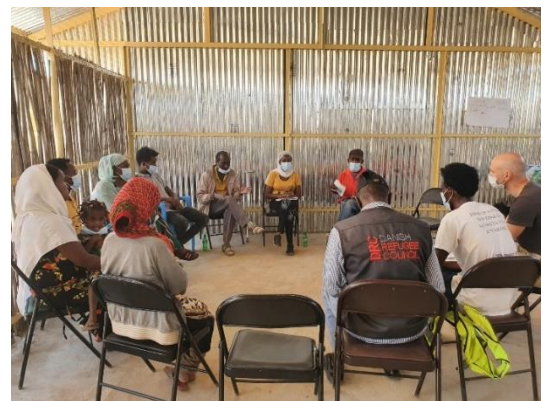
A focus group discussion with refugee representatives on the operation of the grinding mills in Um Rakuba