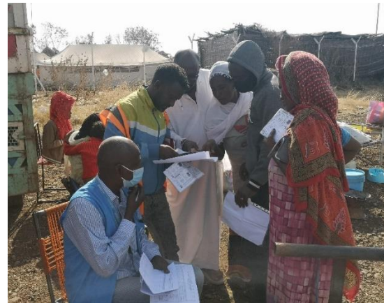
Final checks of the manifest and luggage list with the asylum seekers before their departure from Um Rakuba

Qemant asylum seekers relocated to Babikri: UNHCR, Sudan's Commission for Refugees (COR) and partners relocated 74 Qemant asylum seekers (39 families) from Um Rakuba camp to Babikri settlement. This group had previously indicated during focus group discussions their desire to relocate to Babikri to be closer to their relatives. For the relocation, ALIGHT provided an ambulance with medical staff to escort the convoy. Upon arrival, the newly relocated were assigned shelters, set up by NRC, and provided with hot meals and water by Muslim Aid and Solidarités International. UNHCR and DRC assisted persons with specific needs and MSF Switzerland provided medical assistance to vulnerable asylum seekers. A protection desk has been set up in Babikri settlement to address protection issues and facilitate referrals to the different service providers.