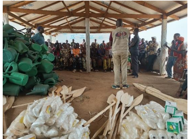
Distribution of farming and fishing kits to refugees and host communities in Nzakara, North Ubangi