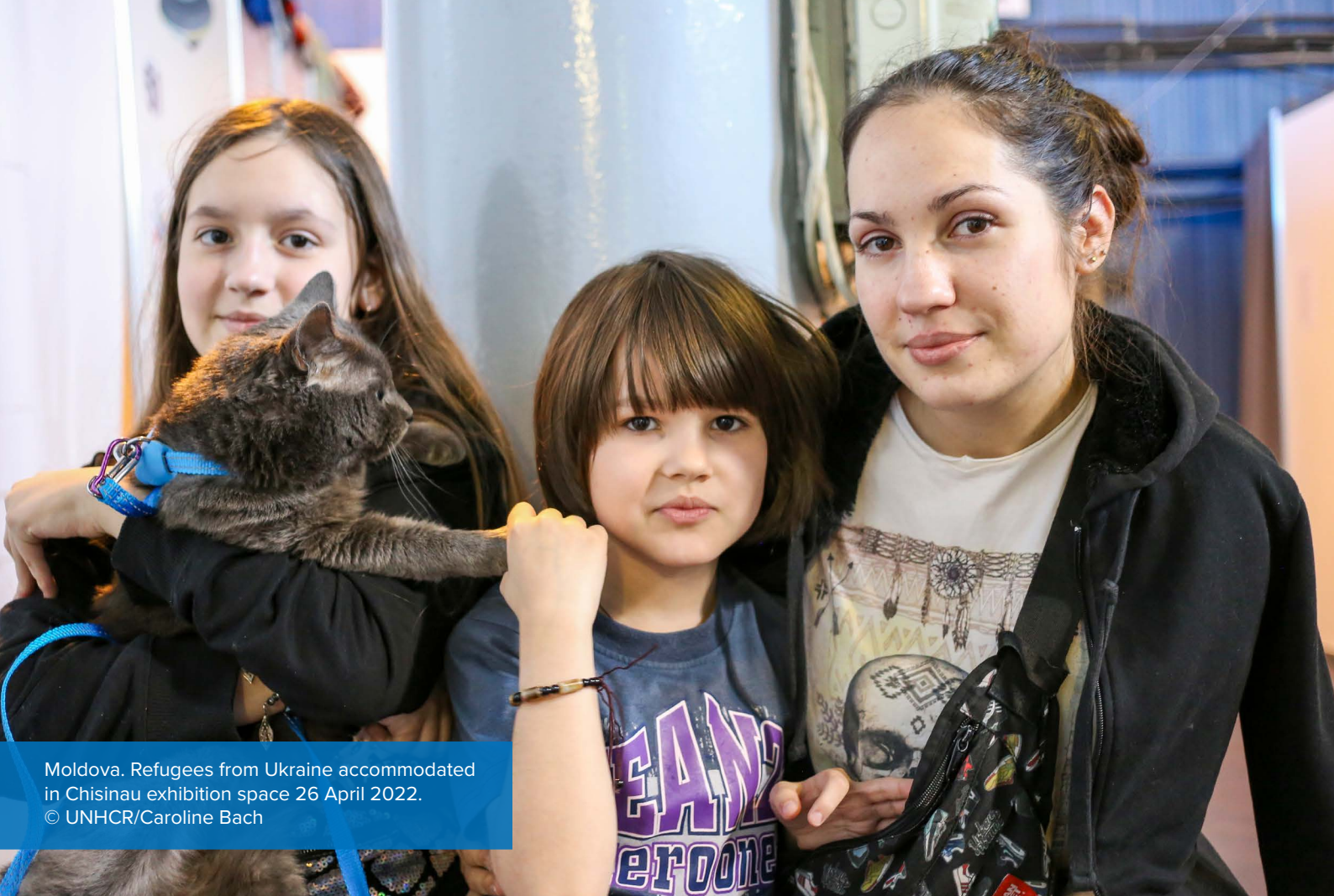
Moldova. Refugees from Ukraine accommodated in Chisinau exhibition space 26 April 2022.