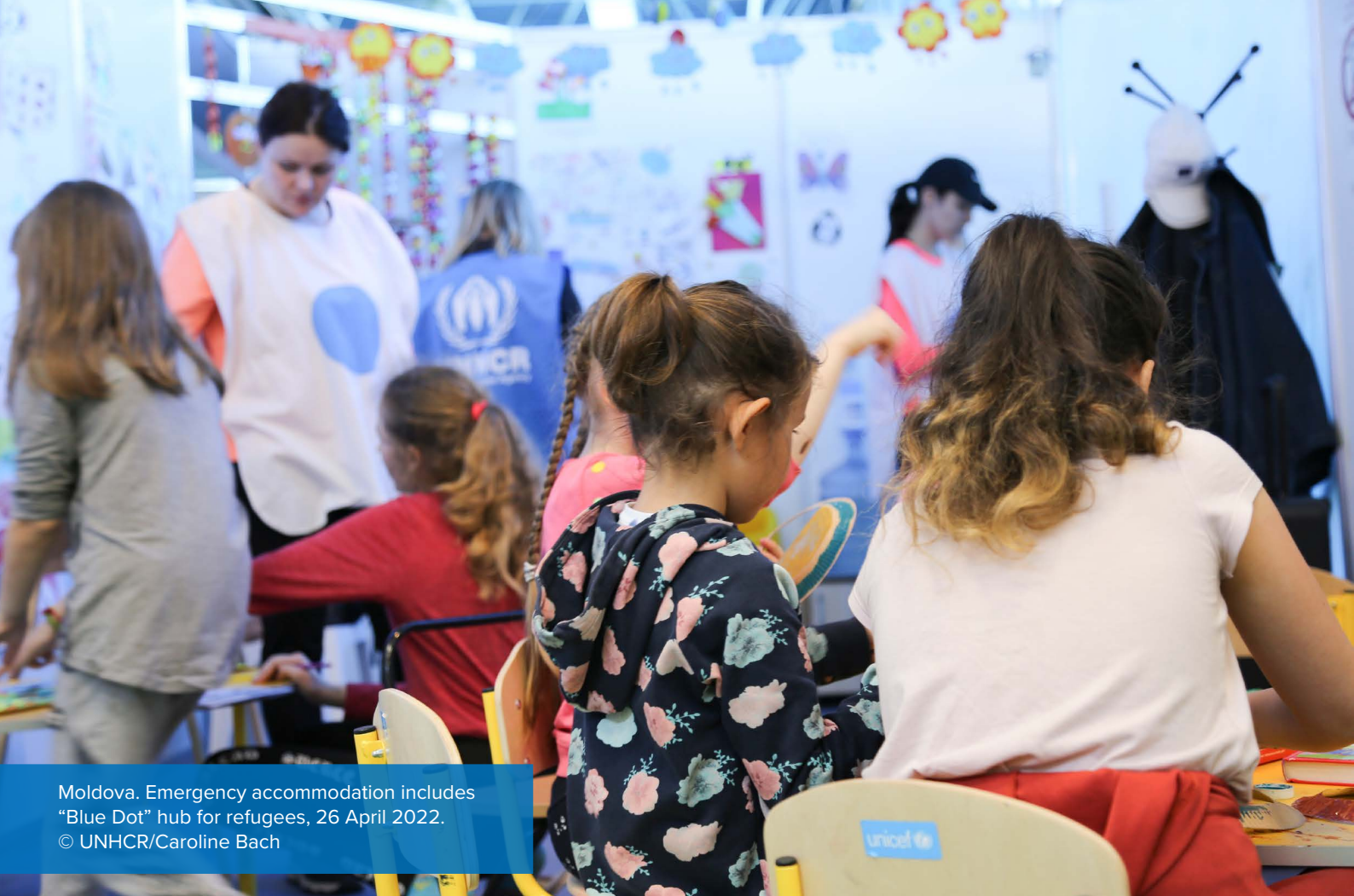
Moldova. Emergency accommodation includes “Blue Dot” hub for refugees, 26 April 2022.