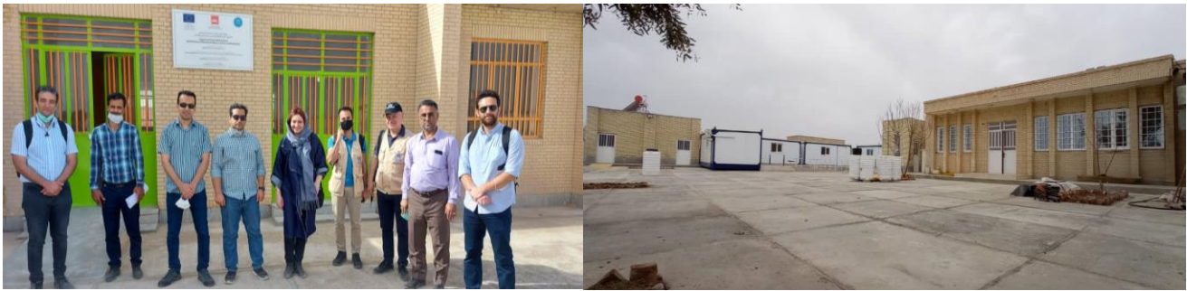
UNHCR and partners visit the NRC rehabilitated school at Niatak site.