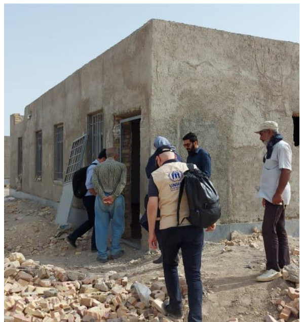
Monitoring visit to Niatak site by UNHCR.