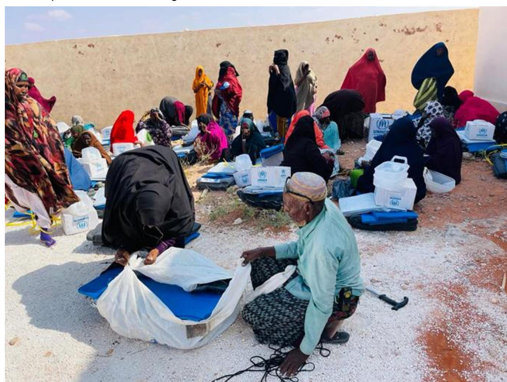
Drought affected IDPs receive NFIs in, Galmudug State.