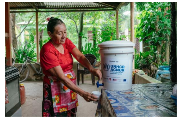
A woman of a solidary family provides drinking water and information to people on the move in Izabal on the border with Honduras.

(Centre for Research, Training and Support of Women) finalized. As part of the closing ceremony, cell phones