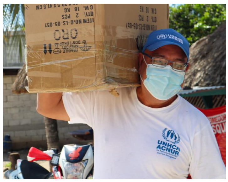
Provision of 90 blankets to the migrant shelter in Santa Elena, Flores, Peten, in response to the heightened mixed movements.