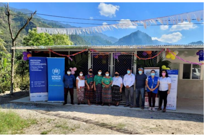
Inauguration of the new community centre in the village Nuevo Queja, San Cristobal Verapaz, Alta Verapaz.

UNHCR and members of the local communities, including female protection agents trained as part of the project, inaugurated two community centres in the villages Nuevo Queja and Santa Elena in San Cristobal Verapaz, Alta Verapaz, that were built jointly by UN Women and CICAM with UNHCR's funds. The centre in Nuevo Queja (a village that was heavily affected by the hurricanes ETA and IOTA in November 2020) supports indigenous Maya Poqomchi women's community protection networks and provides services to pregnant women. The second centre in Santa Elena is used as a safe space for women and children.