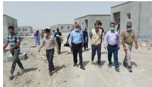
A joint visit of UNHCR, BAFIA S&B and consultancy company to Niatak settlement to observe the ongoing construction activities.