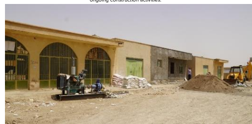
Renovation of existing administration building, South Side of Niatak Settlement, funded by UNHCR.