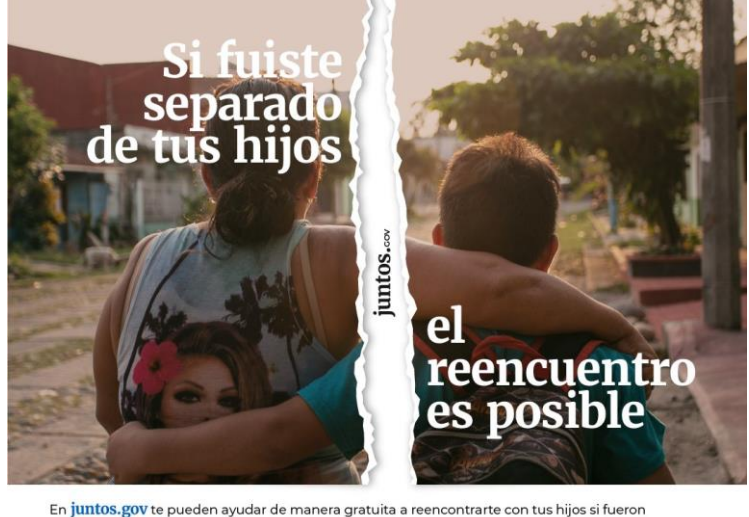
En juntos.gov te pueden ayudar de manera gratuita a reencontrarte con tus hijos si fueron separados forzosamente por el Gobierno de Estados Unidos en la frontera México – EE. UU., entre el 20 de enero de 2017 y el 20 de enero de 2021. Entérate de cómo llamando a la organización KIND.