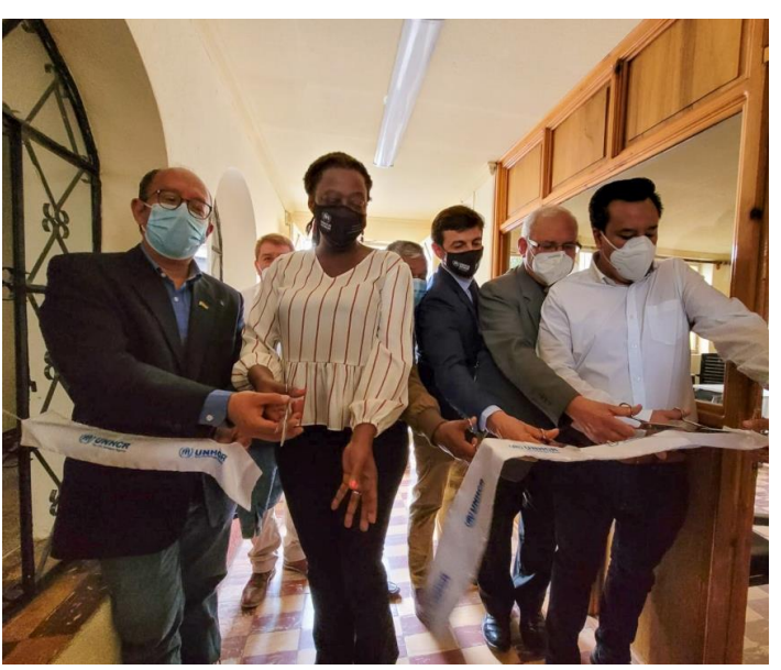
Inauguration of UNHCR's Field Unit in Huehuetenango with the presence of the Governor, Mayor, Bishop and Cardinal of Huehuetenango as well as UNHCR's Representative in Guatemala and the Head of the new Field Unit.

For more information READ the press release about the opening of the new Field Unit in Huehuetenango