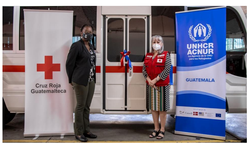
Inauguration of the new mobile clinic by the President of the Guatemalan Red Cross and UNHCR's Representative in Guatemala.

on a rotational basis in locations where the services are most needed.