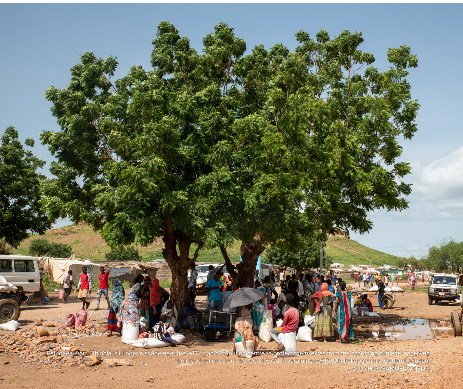
Refugees, from Ethiopia, sit under a shade near the WFP food distribution centre to protect themselves from the scorching sun after receiving their food rations from the World Food Programme (WFP), Um Rakuba camp, Gedaref / Sudan.

The RCF drafts contingency plans for anticipated mass arrivals of refugees from neighbouring countries. The contingency plans establish planning figures and risk scenarios, define the coordination structure, identify preparedness actions and calculate financial requirements for the first 3 months of the emergency response. The RCF has drafted contingency plans for potential influxes from the Central African Republic, Chad and Ethiopia.