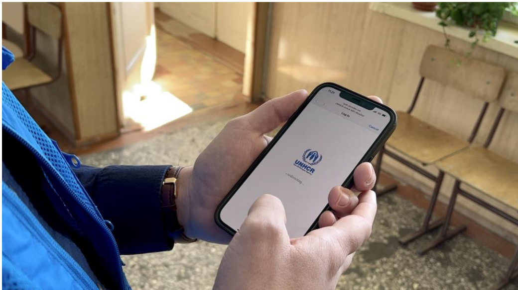
UNHCR partners connect to RETS Wi-Fi in Causeni Train Station