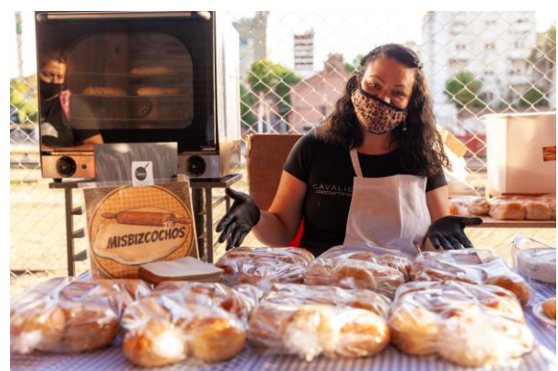
Argentina. A Venezuelan entrepreneur showcases her Venezuelan sweet bread initiative. Her enterprise is called Mis Bizcochos and is one of the 32 initiatives that participated in the "Festival del Reencuentro".

The Inter-Agency Coordination Platform (R4V) and the State-led Quito Process remain key regional mechanisms for harmonizing policies and practices, scaling up and coordinating the humanitarian response and improving access to basic rights. In Venezuela, UNHCR operates within an interagency framework to assist the most vulnerable population groups inside the country, including recent returnees.