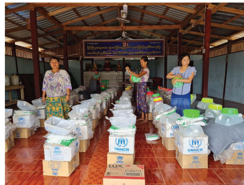
Internally Displaced Persons receive core relief items at a monastery in Kayin State.