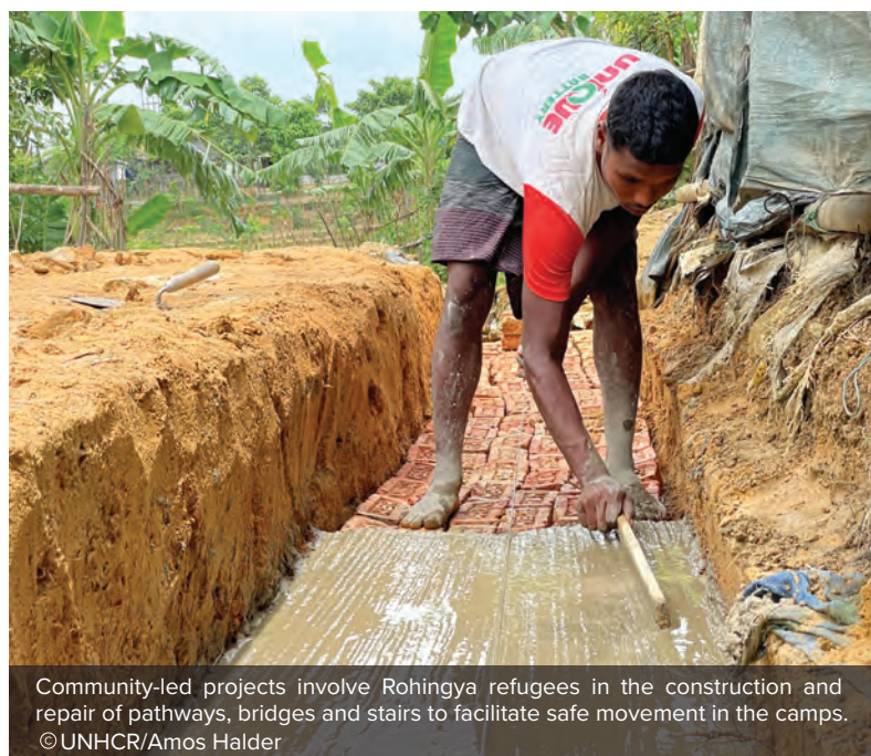
Community-led projects involve Rohingya refugees in the construction and repair of pathways, bridges and stairs to facilitate safe movement in the camps.

Working closely with government authorities, UNHCR and its partner conduct site management activities on the island. This includes coordination of humanitarian activities across the sectors, emergency response and preparedness, distribution of non-food items, ensuring a functional complaints and feedback mechanism, and working closely with the refugee communities. In 2022, UNHCR has recruited and trained refugee Emergency Preparedness and Response volunteers to respond to emergencies and support site management activities.