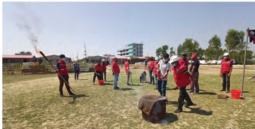
Rohingya refugee volunteers train to become first responders in case of fire emergencies on Bhasan Char.