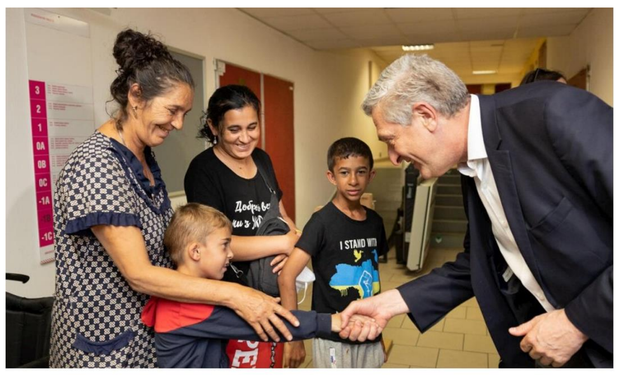
Filippo Grandi, the United Nations High Commissioner for Refugees visits the Regional Assistance Center for Aid to Ukraine in Ústí nad Labem, Czech Republic on June 26, 2022.

Entering in a new phase. Although very high, the initial unprecedented solidarity may wane and will need to be continuously enhanced. Stricter rules in the "Lex Ukraine" will be implemented including an end to the humanitarian allowance for refugees with free accommodation, food, and basic hygiene products, and health insurance coverage for refugees limited to a maximum of 150 days, except for children and the elderly. Vulnerable refugees will gradually be included in the social safety nets already in place for vulnerable Czech people. Not only to decrease the pressure on the capital Prague, but to also stimulate the economy in the regions, the authorities will set up a coordination mechanism and measures to motivate refugees to relocate from the capital to less crowded municipalities.