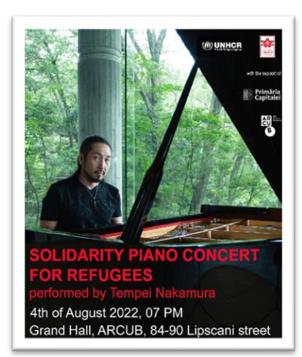
Poster of the "solidarity piano concert for refugees" in Bucharest, Romania 4 August 2022

To ensure prevention of and response to genderbased violence (GBV), UNHCR has translated a GBV pocket guide in Romanian. This guide was shared amongst protection actors that are participating in the Protection working group. In addition, a GBV poster in four languages (English, Romanian, Ukrainian and Russian) with various