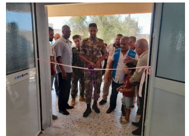
The ceremony at the 17 February Primary Health Care Centre, Ejdabia.

On 11 August, a ceremony was held, marking the completion of rehabilitation work at the 17 February Primary Health Care Centre, in Ejdabia, eastern Libya. The work was part of UNHCR's Quick Impact Projects (QIPs), overseen by partner ACTED Libya. QIPs are aimed at strengthening community resilience and improving access to basic services in areas hosting large numbers of displaced Libyans, returnees, and asylum seekers. The clinic serves around 1,500 people each month. Under the project, water, hygiene, and sanitation facilities were renovated; new doors, windows, air conditioners, and new lighting were installed. Access was also improved for people with disabilities and the facility was re-painted.