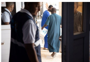
NFI distribution in Azzawya.

UNHCR and partner LIBAID have been distributing non-food items (NFIs) for displaced Tawerghan families at Azzawya, 50 kms west of Tripoli. 115 displaced Libyan families were targeted for assistance. Items include mattresses, blankets, plastic tarpaulins, water buckets, kitchen sets, children and adult diapers, and baby kits. UNHCR, with partners, continues to provide help and services to some of the most vulnerable asylum seekers and refugees. Last week, partner IRC distributed hygiene kits and baby diapers to 63 individuals, including 24 women and eight children at the Community Day Centre and core relief items to 362 individuals, including 185 women, in different areas of Tripoli. Partner CESVI provided emergency cash assistance to 15 households (26 individuals). At Serraj Registration Centre, UNHCR identified 33 individuals who managed to escape or who were released from trafficking camps. They were all referred for protection interviews to identify their needs and provide the necessary assistance. Last week, 20 best interest assessments (BIAs) and 84 protection needs assessments (PNAs) were conducted with children and adults to identify their protection concerns, assess their needs, and decide on the required follow-up actions. Based on the assessments, individuals were referred to specialized services.