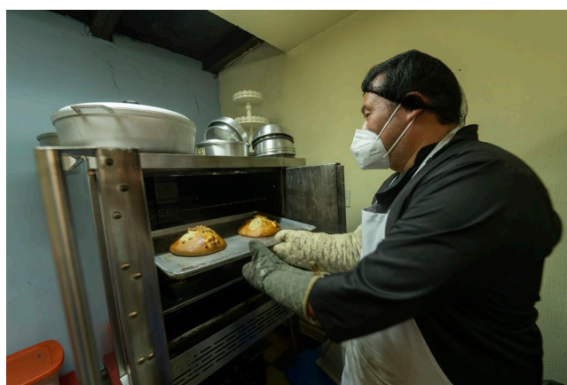
Together with its partner La Alianza, UNHCR equipped and inaugurated a new baking school in Villa Nueva.

Promoting entrepreneurship is increasingly seen as an effective approach to overcoming challenges of the economic and social inclusion of refugees in Guatemala. To support the self-employment of persons of concern, UNHCR and its partners carry out: market and value chain studies, strengthening life skills, training for entrepreneurship, seed capital for the start/strengthening of innovative enterprises, business advice, business acceleration, and incubation and accompaniment.