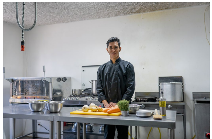
Refugee participant in the business internship program.