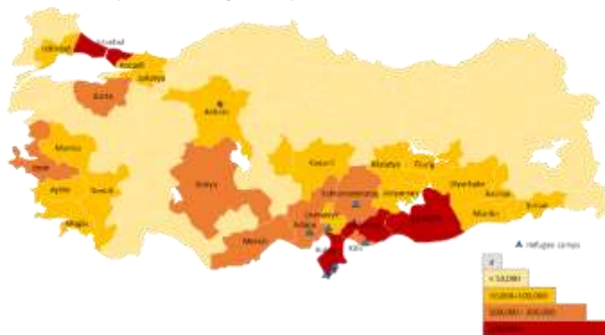
Syrian Refugees by province Map June 2021